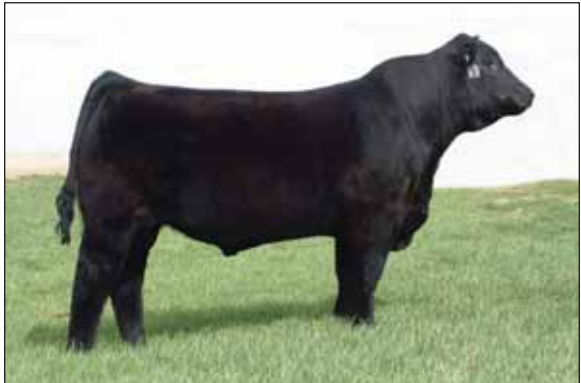
Sire of Lot 17B Embryos, RDD Destiny's Ace