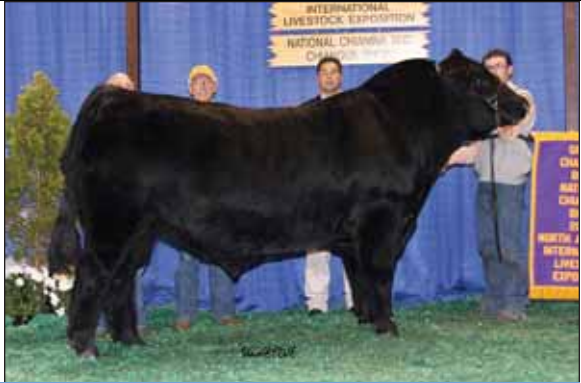
Sire of Lot 17A Embryos, Four Roses Destination 15T