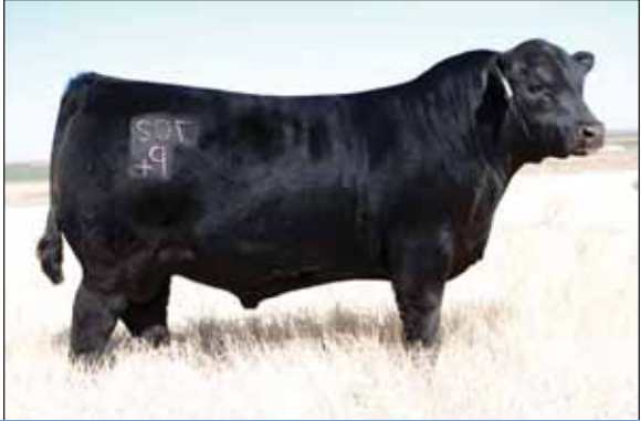
Sire of Lot 6, Duff Encore 702