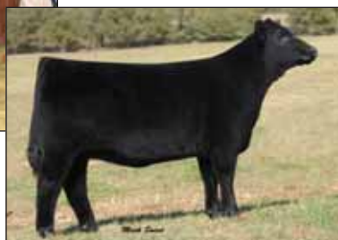
Daughter, HBCS MS Blackberry 133X