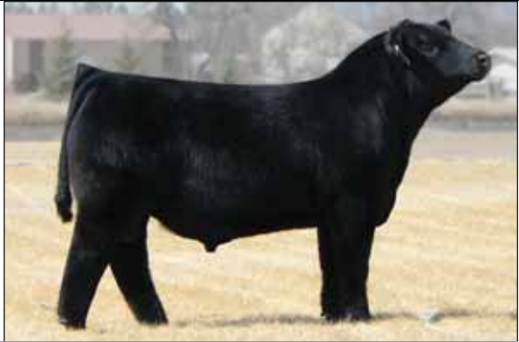
Sire of Lot 14, JSC Momentum 74T