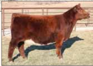
CYT Max Rosa, maternal grandam of Lot 13.