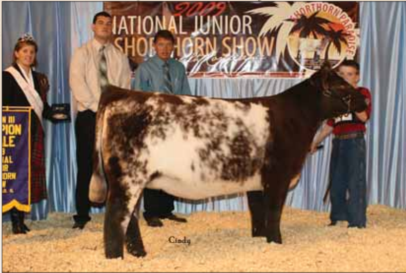
SULL Lady Crystal 8213, dam of Lot 32.