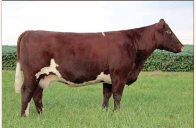
AF Playful Cait 902, dam of Lot 30.

LOT 30A - AF Playful Cait 1856 - Heifer, Horned, Roan, calved 11.05.18, tattoo 1856, ASA# *ar4283772. Sired by SULL Prime Made 2105.