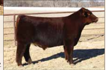
SULL RGLC Red Ransom, sire of Lot 52.