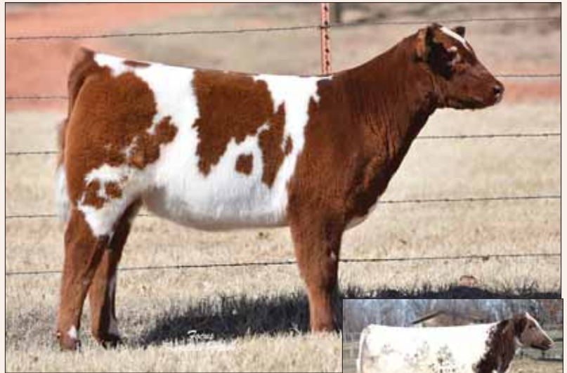
SS Dare to Dream 8207, dam of Lot 17.

high as we were on that female, I think this one steals the show. Powerful with spring of rib like the full sib before her, but this heifer is as freaky fronted as I could draw one up. She will be hard to get around in her division.