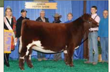
SULL Blooded Ruby, daughter of SULL Red Blood.