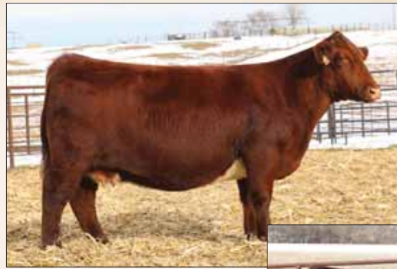
SULL Red Rosemary -3 ET Cl, dam of Lot 52.

Red Ransom is a combination of true muscle shape and structural correctness. SULL Red Rosemary is a past NAILE and NWSS Champion. She stems from a cow family that help transition the Shorthorn breed into a powerhouse in the show ring. She is a full sib to breed legends such as CF Solution, SULL Right Direction, SULL Rose Mary 636, and HD Ruby 903. Red Rosemary herself is the dam to SULL Roses Are Red who was past NWSS, NJHS, and American Royal Champion.