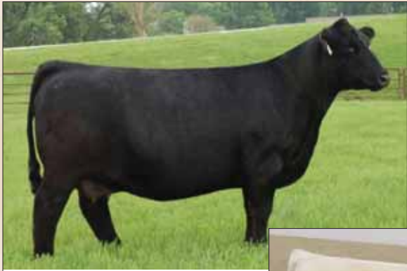
SULL Stockman 8233, dam of Lot 55.