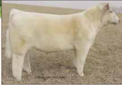
DF Vegas 310M, sire of Lot 55.