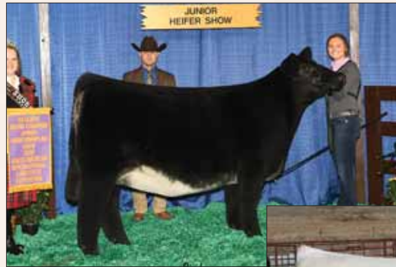
SULL Lady's Ice 7179, full sib to Lot 53.

show but is now clicking extremely well on the ShorthornPlus division. Her two I80 heifers that sold in the 2017 Maternal Legends sale averaged $10,000. Another sister to this mating SULL Lady's Ice 7179, was selected champion ShorthornPlus at the 2018 American Royal Open Show and Reserve Grand Champion in the Junior Show along with Reserve Champion ShorthornPlus at the NAILE in the Open and Junior Show. Note these embryos will be dual registered MaineTainer and ShorthornPlus.