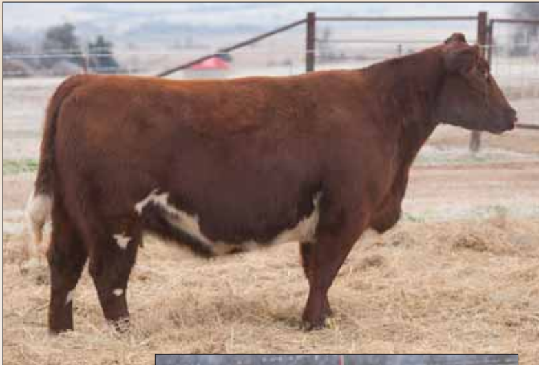
SULL Rosa's Maxie 3820, dam of Lot 27A & 28B.

LOT 28A - /F Prairie Rose - Heifer, Polled, RWM, calved 08.12.18, tattoo 8456, ASA# *x4274069. Sired by GPN Hot Classic 3N35. Another easy fleshing female that has calving ease built in. She has a quiet disposition and will add quality to anyone's herd. THE, PHAF, DSF