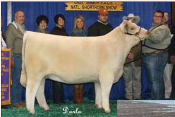
BCC Darla 502R, dam of Lot 3.