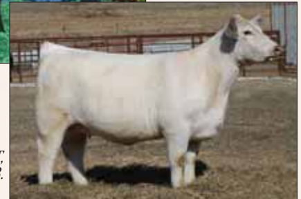
SULL Lady Crystal 434P-6 ET, dam of Lot 53.