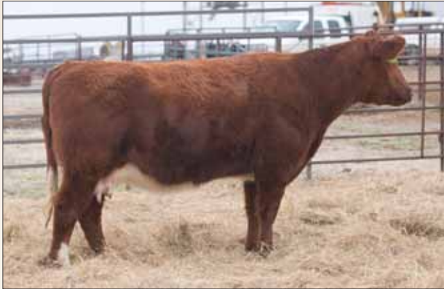
LOT 41 - SULL Proud Rose Mary

We had the misfortune of losing 1238's heifer calf by Red Man shortly after weaning. We had high hopes for her in the Red Dirt offering. A full brother was 123's 2017 calf and he sold for $11,000 to Texas as a steer. This is a very productive cow and she will compliment any sire you choose to breed her to.