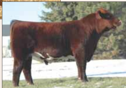
Little Cedar Aviator 503X, sire of Lot 2.