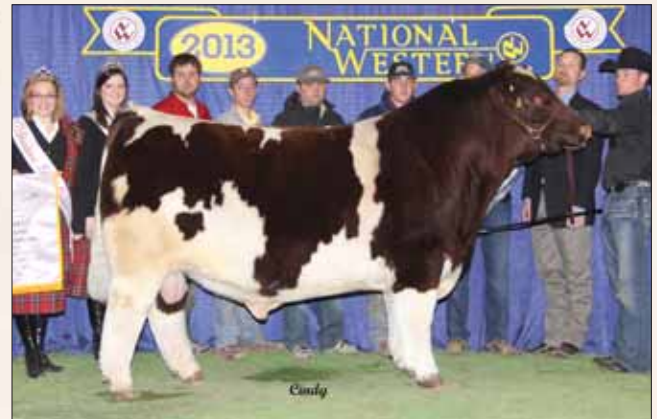
SULL Master of Rose, sire of Lot 45.