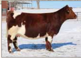
SULL Desert Rose 0004, dam of Lot 7.