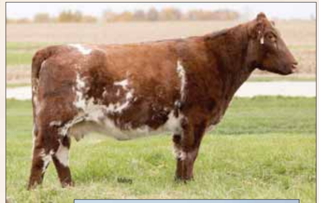
LOT 37 - AF SL Mirage 1208