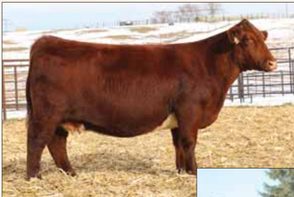
SULL Red Rosemary, dam of Lot 2