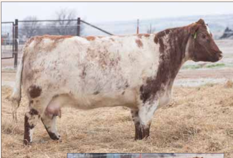
LOT 28 - GAL Rose 456