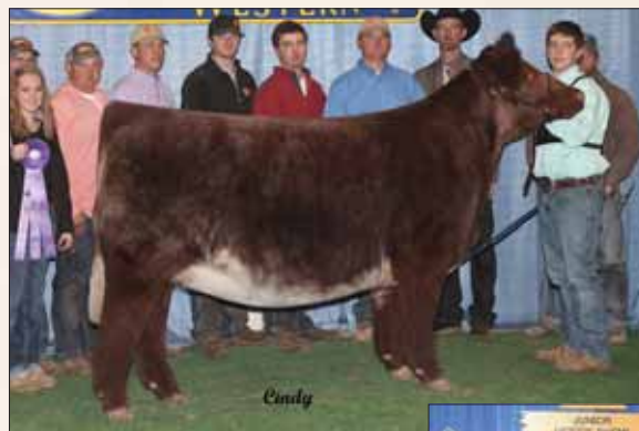
SULL Cool Crystal, daughter of SULL Red Blood.

LOT 64B - SULL Red Blood *x4181029 - Selling one package of two units of semen.