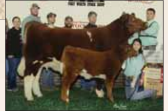
2G Waco Revival 1407F, full sib to Lot 10.