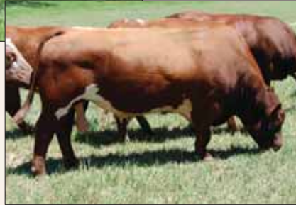
CF Solution, sire of Lot 1.