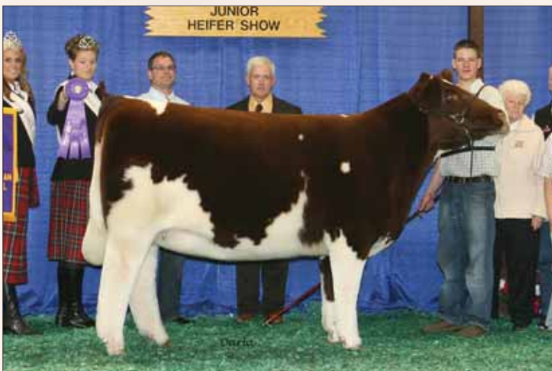
SULL Rose Mary 636-2 CL, dam of Lot 9.