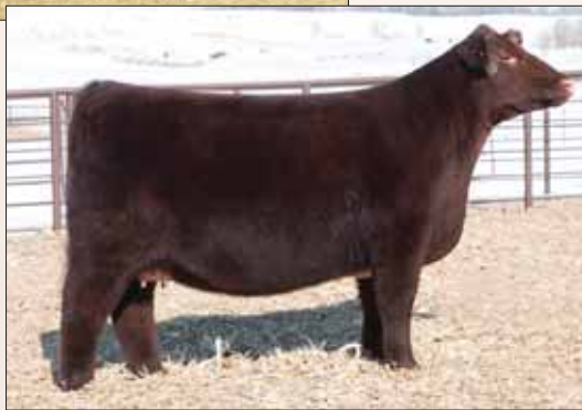
A FREE K-Kim Hot Commodity daughter.

LOT 62B - FREE K-Kim Hot Commodity *x4141432 - Selling one package of three conventional units.