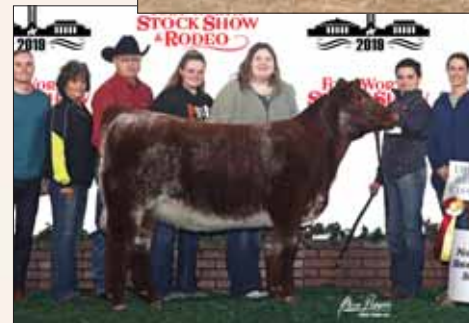
AF Blue Moon, son of Lot 37.