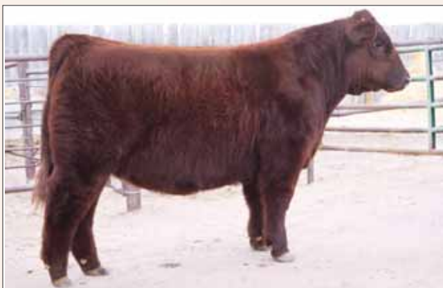
Little Cedar Ride On, service sire to Lot 43.

A daughter of the 1023 female that is also selling as Lot 36. Long necked and feminine headed, this young female has brood cow written all over her. Plenty of volume and a classy look that will make her stand out in anyones herd.