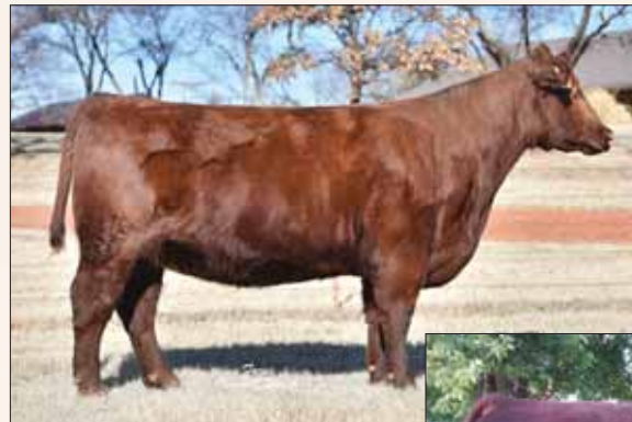
SULL Margie's Traveler, dam of Lot 54.