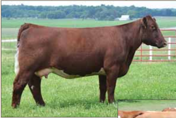
SULL Mona Lisa Reward, dam of Lot 1.