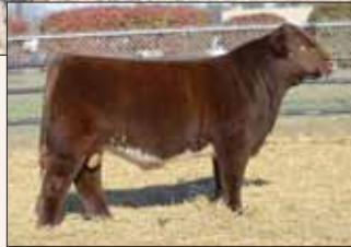
Little Cedar Final 4, sire of Lot 19.