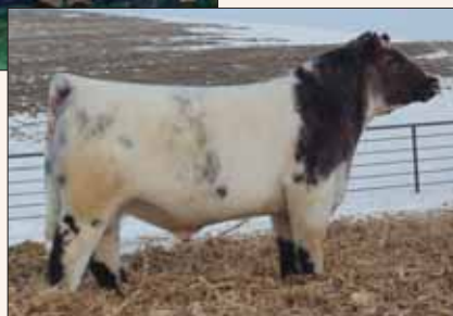
SULL Muscle Man 9043, sire of Lot 3.