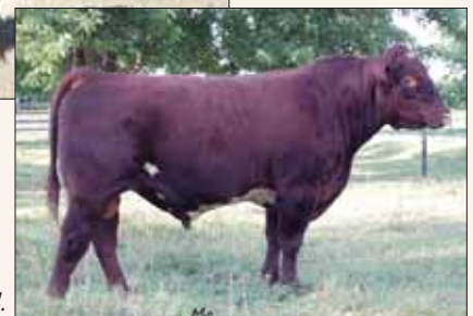
FREE K-Kim Hot Commodity, sire of Lot 54.