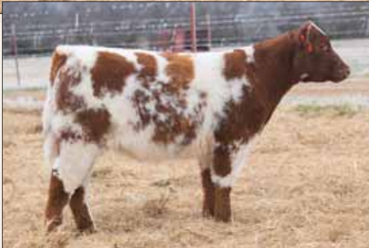
LOT 27B - /F Max's Roan Rock 8820