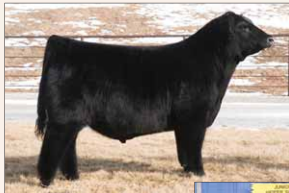
SULL Ferrari 6597D

SULL H/F Crystal Judy, 2018 NAILE Supreme Champion Female and Grand Champion ShorthornPlus, a sister to SULL Ferrari.