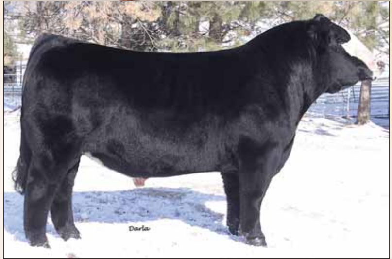
MR HOC Broker, maternal grandsire of Lot 16.

Brood cow all the way, this female is the soggy sound cool fronted showing heifer everyone wants that will turn into an amazing production female. The genetics in this package is a great fit no matter how your operation is geared, show or production. Watch for pictures and videos updates.