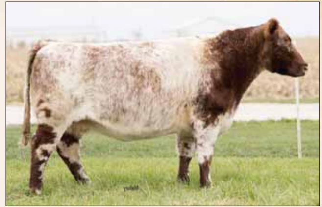
LOT 36 - AF American Dreams 1023

A beautiful female sired by the Canadian out cross bull Legend. Very sound and feminine, she also has the volume and look to work well with many different bulls. She's never had a bad one!