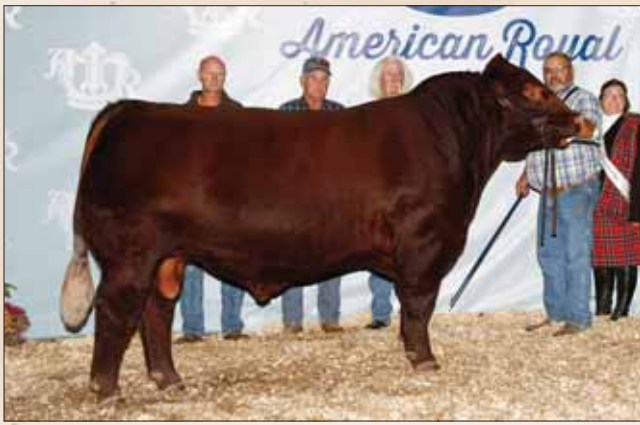
K's Home Brew, service sire to Lot 40.