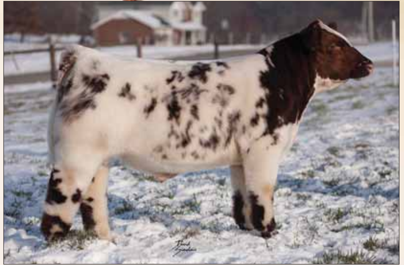
FSF Assassin 74Z, sire of Lot 29.

LOT 29A - AF Margie's Dream Girl 1854 - Heifer, Horned, Roan, calved 10.15.18, tattoo 1854, ASA# *4283767. Sired by SULL Prime Made 2105.