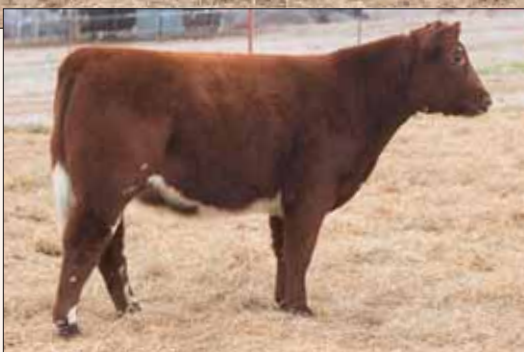
LOT 28A - /F Prairie Rose