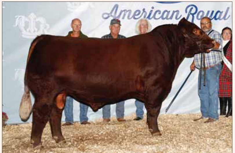
K's Home Brew, service sire to Lots 29 - 31.

LOT 31A - AF Shannon Minnie1853 - Heifer, Polled, Roan, calved 10.15.18, tattoo 853, ASA# *xar4283768. Sired by SULL Payday 1507 ET.