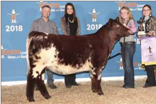
A SULL Red Shield daughter sold by Alden Farms.

One of the most successful cow families in Shorthorn history. This cow is deep bodied and powerful. She has a perfect udder and is the kind to raise great ones for years to come. THC, PHAF, DSF