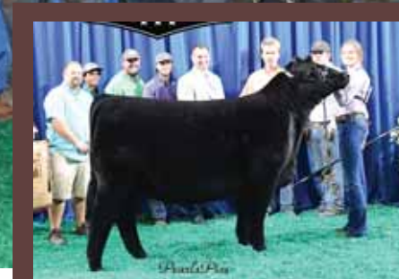
2019 Sweepstakes Grand Champion SimAngus Heifer