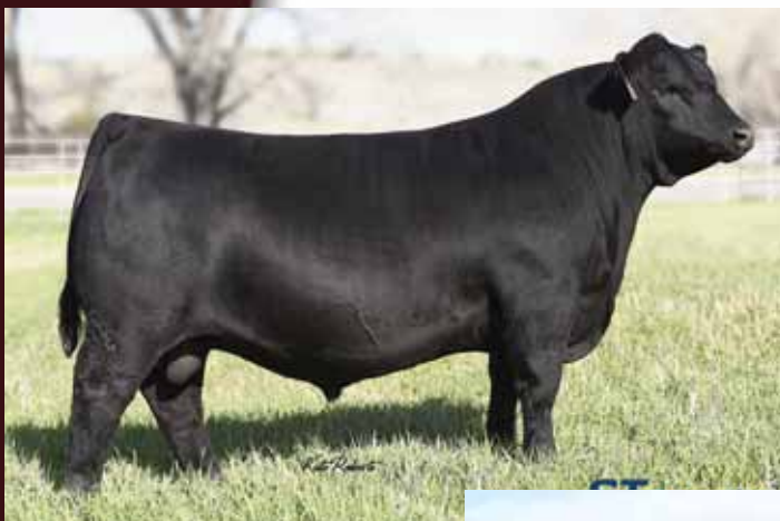
S A V Raidance 6848, sire of Lot 5A