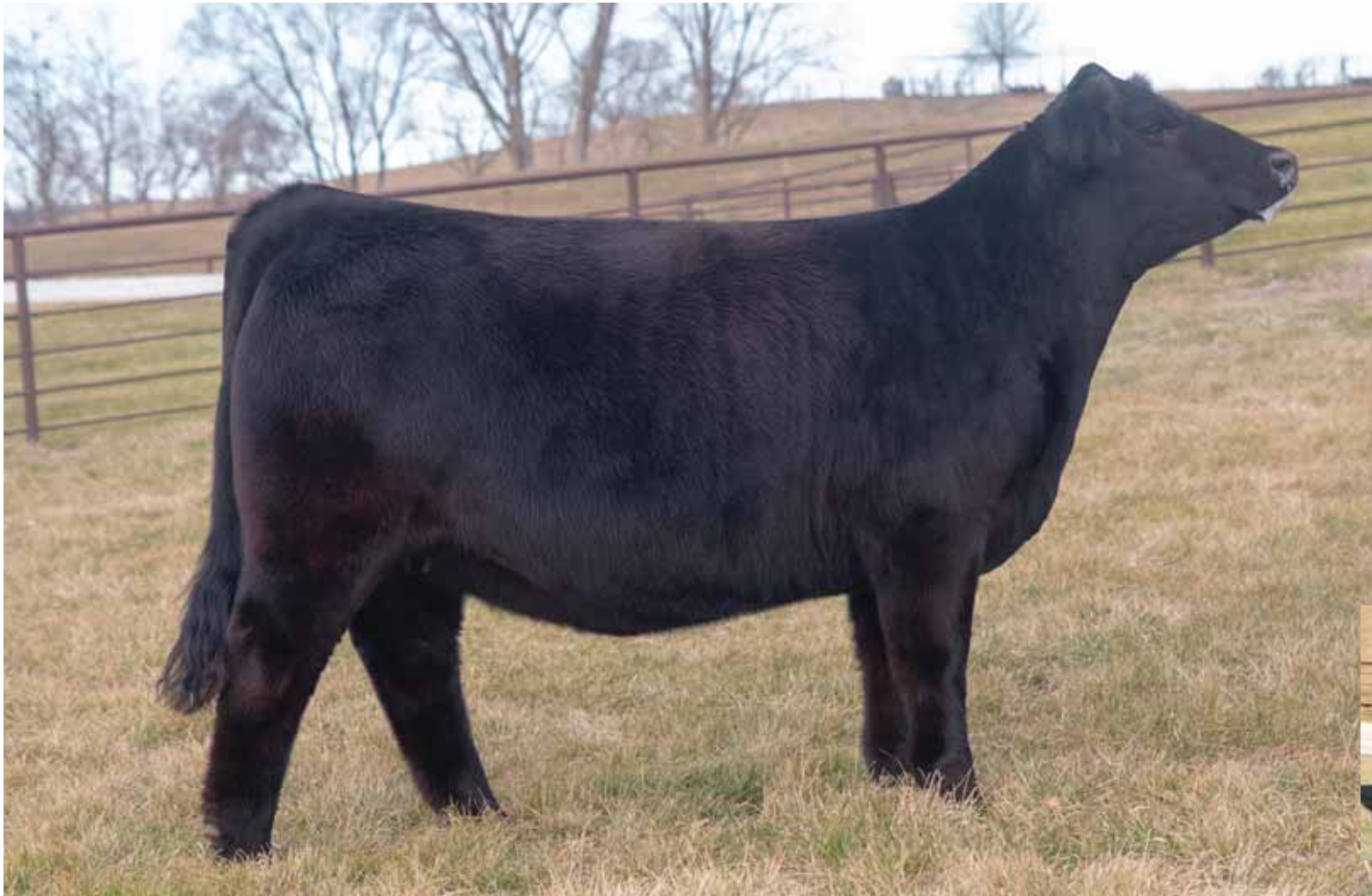
JSUL Mary's Profit 8352F, Lot 16, is a full sib to Lot 17 embryos.