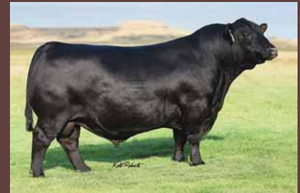
V A R Power Play 7018, sire of Lots 10A, 10B & 10C

EXAR Miss Beauty, the dam side of these pregnancies, is equally impressive. She had three sons in the 2018 NWSS Grand Champion Carload for Express Ranches and has over $100,000 in progeny sales at Express. This female produces.