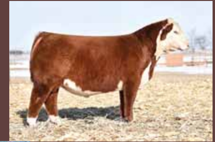
ECR Shameless 7586, sire of Lot 14A