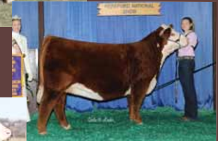
KOLT Carly's Harley 2858, full sister to donor dam SULL Harley's Drive 6153D