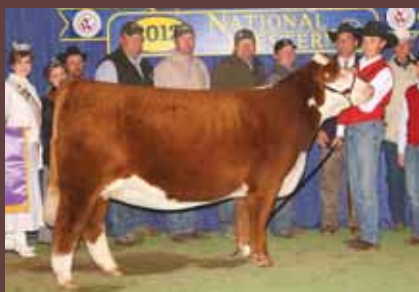
TCC Ms Diana 01, dam of Lot 11