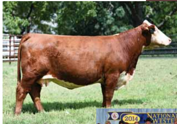
SULL Harley's Drive 6153D, donor dam of Lot 14.