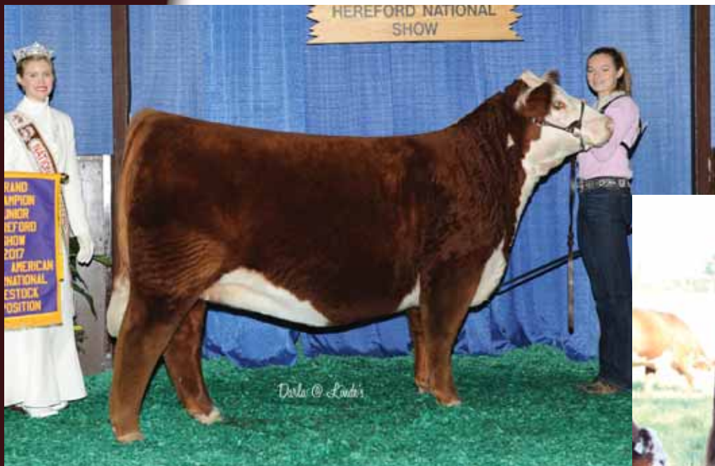
KOLT Carly's Harley 2858 ET, dam of Lot 13