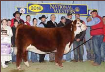
SULL TCC Diana 4064B, two-time Denver Champion and full sister to Lot 11