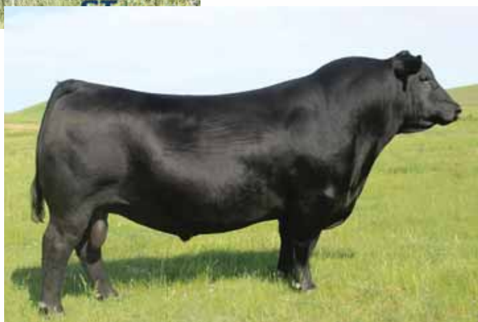
S A V President 6847, sire of Lot 5B