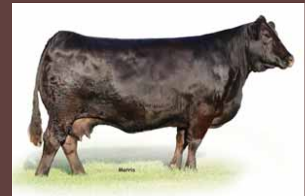
AUTO Exceptional 282S, dam of Lot 10C

AUTO Exceptional 282S, the matriarch donor at Buck Ridge, has elevated our cowherd and is influential in so many females. She has 99 registered progeny from multiple sire groups, and time after time her progeny rise to the top. Her daughters continue to be the top-producing cows at Buck Ridge and in many other herds. Her daughter, HBRL Bambi 489B, produced the herd sire, HBRL Deluxe Package 6114D, the MAGS Zodiac son working in the Pinegar Limousin and Buck Ridge herds. Her daughter, HBRL American Pie 370A, produced the $20,000 herd sire, CELL 20/20 working in the Jones Brothers and Linhart programs. She also produced the herd sire, AUTO Lode Up 137B, sired by EXAR Denver 2002B. And when mated to the big-numbered Angus bull, V A R Power Play, it only enriches the value of the bull calf.