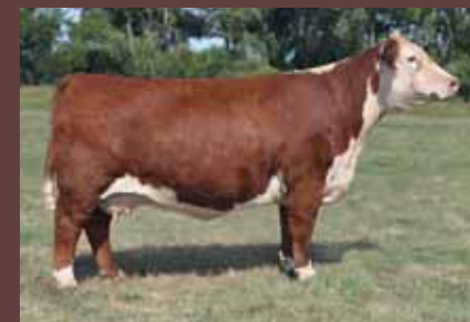
LCC Two Timin 438 ET, dam of Lot 12.

Females like this don't come along very often, she is the kind that can help improve anyone's program. We can say with confidence that Kolt's Carleys Harley 2858 is just waiting to produce the next sale topper and Denver champion.