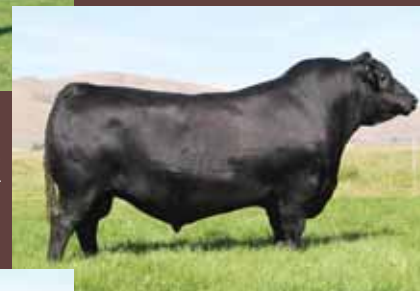
Coleman Bravo, maternal sibling to 504