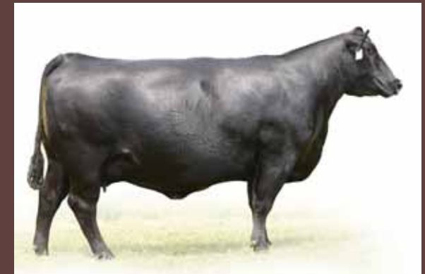
EXAR Miss Beauty 2819, dam of Lots 10A & 10B