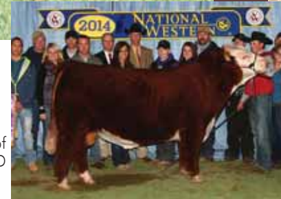
C Miles Mckee 6153D, sire of donor, SULL Harley's Drive 6153D