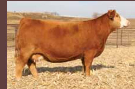
SVJ She's the Dream B796, dam of Lot 3 and selling as Lot 2.