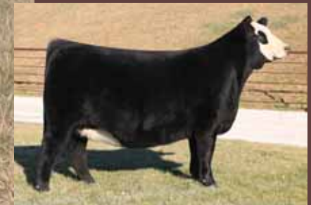
JBSF Proud Mary 317C, dam