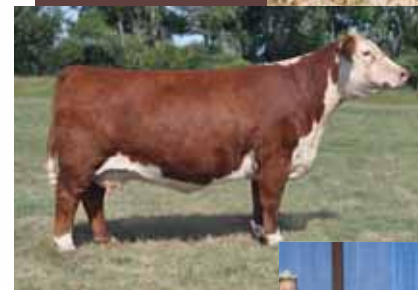
LCC Two Timin 438, maternal granddam of Lot 14

SULL Harley's Drive 6153D is the result of a very prolific mating in the Hereford breed, she combines the genetics of the $75,000 LCC Two Timing 438 and the $600,000 C Miles McKee 2103. Not only were both her parents Supreme champions but full sisters to 6153D have won the Nebraska, Illinois, Missouri, Iowa State Fairs. Sull Harley 4267 was the 2015 NJHE Res Champion heifer and the $90,000 Kolt Carly's Harley 2858 who won the 2017 NAILE and 2018 Res Champion at NWSS are both full sisters to 6153D. No matter whether you choose the proven mating of ECR Shameless who is a full brother to ECR Who Maker, H Montgomery the $130,000 reigning American Royal Champion or H Authority the off the open market sire of champions you won't be wrong. All three matings will be the winning slot machine you were in Vegas looking for!