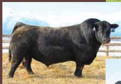
Coleman Charlo 0256, sire of Pregnancies