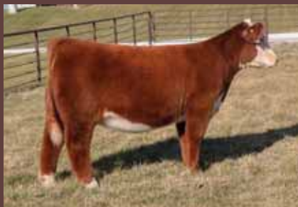
SULL Special Diana 919G ET, Lot 11