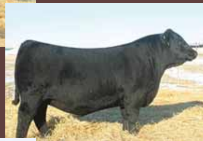
SAV America 8018, Charlo son