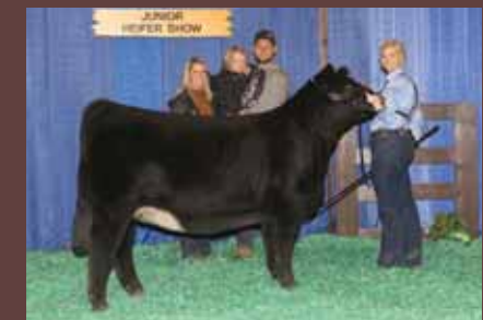
JSUL Proud Mary 8380F, full sister to Lot 16 & 17