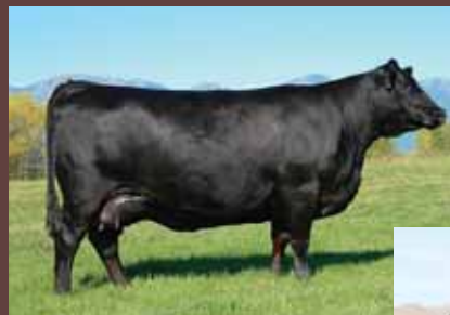
Coleman Donna 714, dam of 504