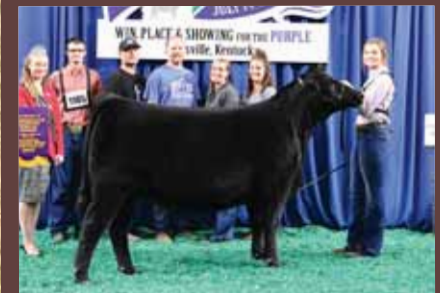
Division Champion, 2019 National Junior Angus Show