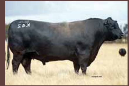
Millah Murrah Klooney K42, sire