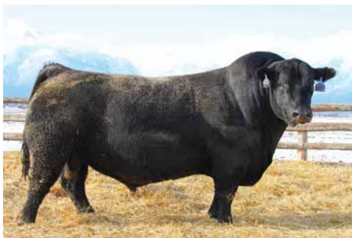
Coleman Charlo 0256, sire of Lot 6A & 6B embryos