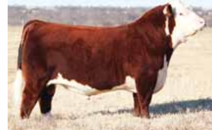
H FHF Authority 6026 ET, sire of Lot 14C

Consigned by Owen Brothers Cattle Company, Bois D Arc, Missouri