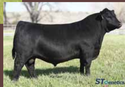
S A V Raindance 6848, Charlo Son