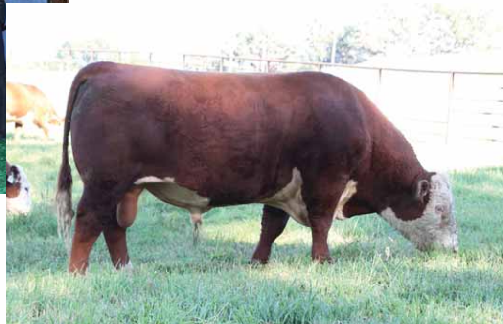
ECR Who Maker 210 ET, sire of Lot 13