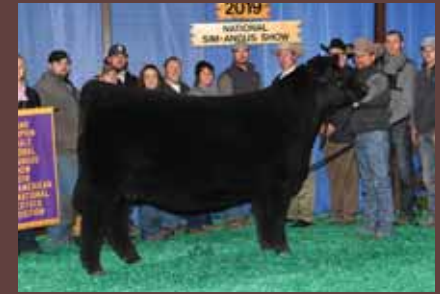
JSUL Dream Big 8992F, the 2019 NAILE Grand Champion % Simmental Female, and a full sister to Lot 3.