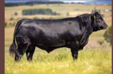
HW Fletcher, son of Fleur M710