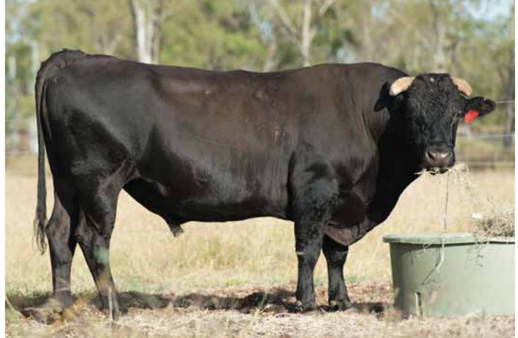
Westholme Hiramichi Tsuru, Lot 15