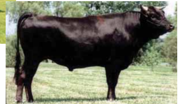
World K's Michifuku, sire of Lot 10 embryos.