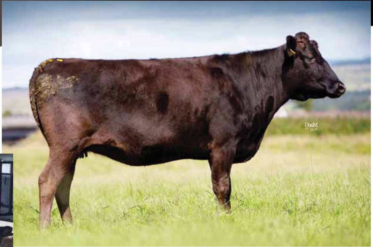
Highland Wagyu Aizatake 7, dam of Lot 12.