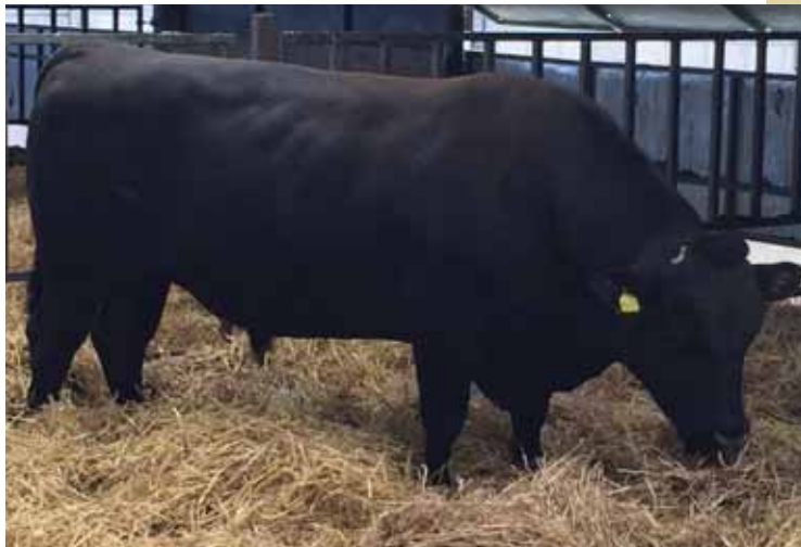
Highland Wagyu Kenzo, sire of Lot 12 embryos.