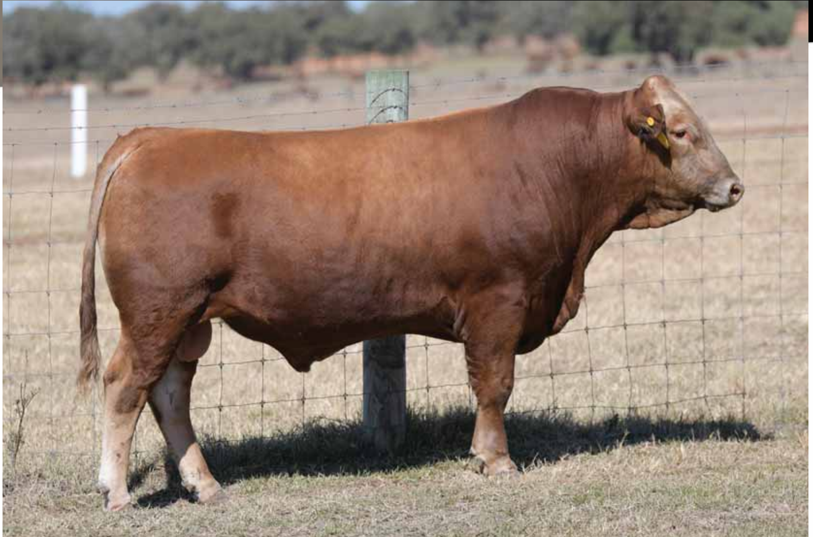
LG 2078F ET, Lot 17