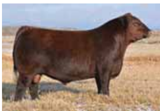
SIRE: Six Mile Signature 295B, sire of Lot 14