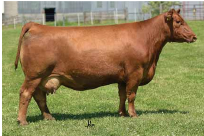
DAM: Damar 101J Blockana A121, dam of Lot 20 & 21 embryos

Lookout- the genetic combination here is sure to stop you in your tracks wherever you are. These IVF non-sexed conventional embryos have a pedigree depth that is so intricately defined through each individual in their lineage. DAMAR 101J Blockana A121 is one of the greatest females to come from the Cloud 9 Cattle Company dispersal. She is unrivaled in terms of a highly sought after and high caliber pedigree. She is a daughter of the great Red Fine Line Mulberry 26P and goes back to the legendary DFRA Blockana 101 donor female. MANN Red Box 55C is a program leader of a bull and is talked about all over the United States, Canada and South America. Red Box is a bull that has an unmatched phenotype and genetic profile.