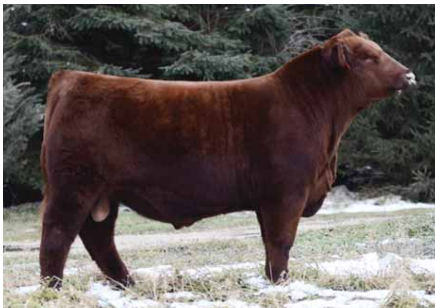
LOT 15: TLC Fight Night 1025F ET