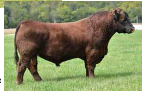
SIRE: MLK Big Foot