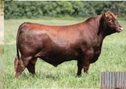
SIRE: Red U2 Blue Collar 295E, sire of Lot 5A