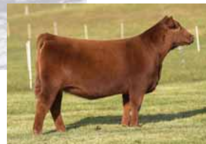
Daughter of Lot 7.