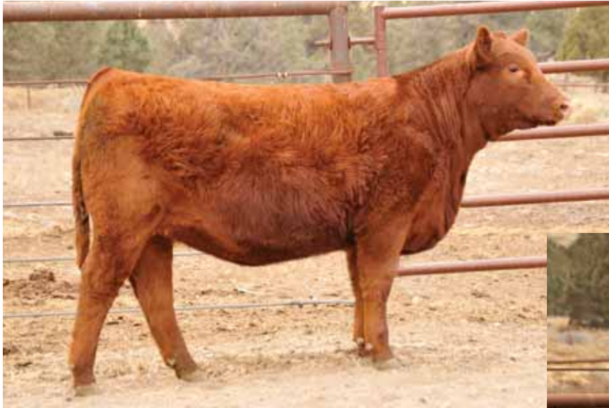
LOT 2A ... VF MS Flo Marie 9003-1637