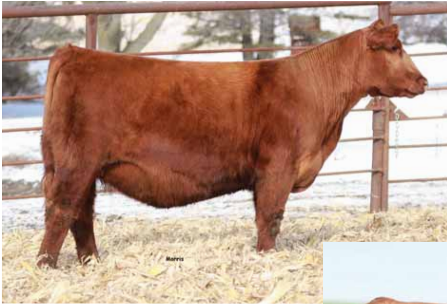
DONOR DAM: J6 Advance E501