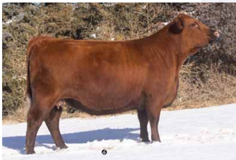
LOT 13C: Bar S Lady 8556