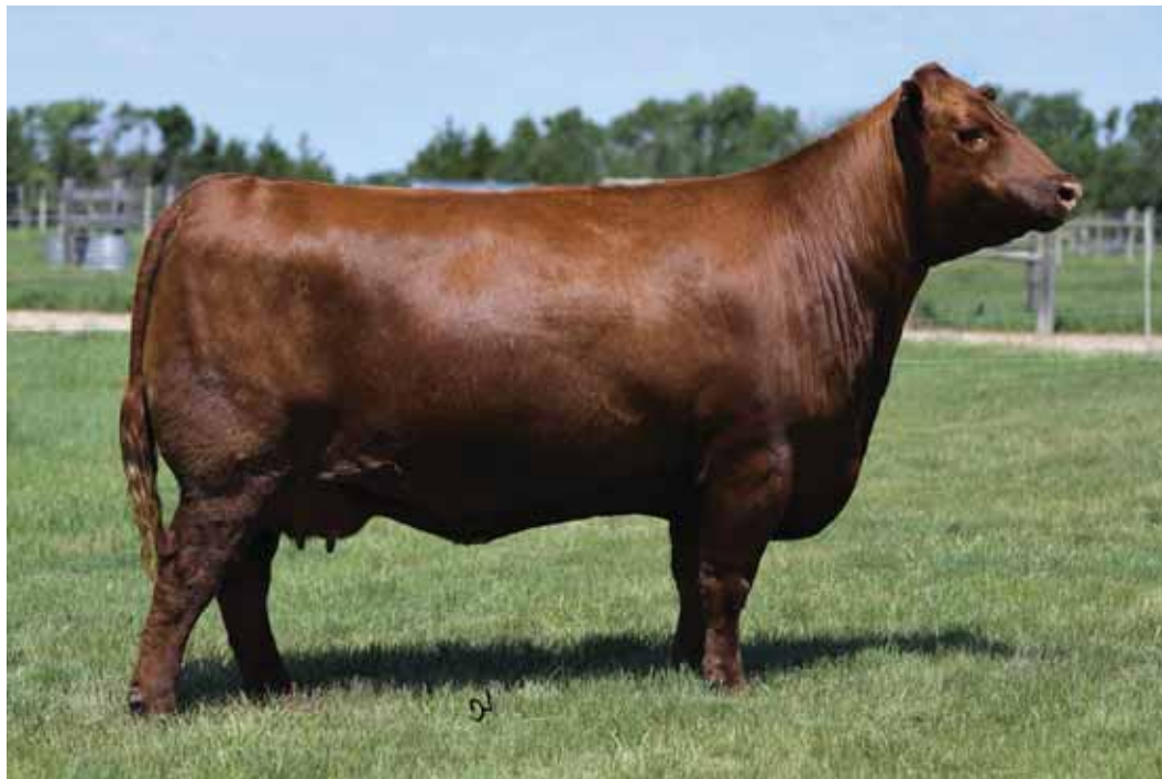
DAM: Red Blairs Priscilla 44Z R, dam of Lot 18A & 18B embryos

The donor dam, Red Blair's Priscilla 44Z, has become one of the most recognizable Red Angus donor females in North America. Her sire Kargo has made his mark producing top females and bulls for both Blairs.Ag Cattle and TimberCreek. Individually, Priscilla 44Z, possess a combination of structural soundness, base width and fleshing ability even the most astute cattlemen would appreciate. Her offspring to date have been exceptionally high performing and marketable, top many sales across North America! We feel these matings with Red Box and PTO speak for themselves and represents the progressive direction of acclaimed Blairs.AG breeding program. We invite you to appraise the unmatched genetic value on offer.