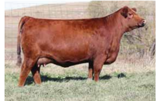
MATERNAL SIB: The $51,000 daughter of donor dam to Lot 17 embryos.