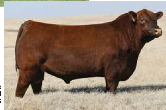
SIRE: MANN Red Box 55C, sire of Lot 18A embryos