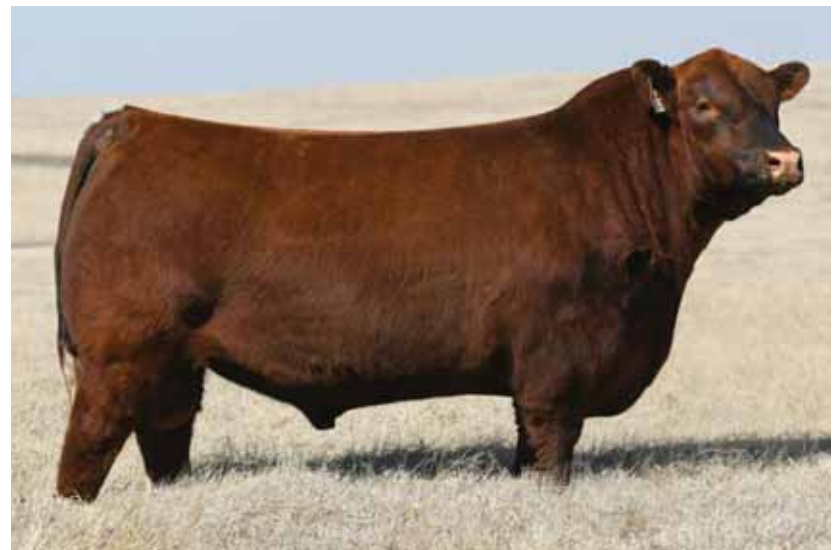
SIRE: MANN Red Box 55C

Consigned by Lind Family Farms, Rushford, MN