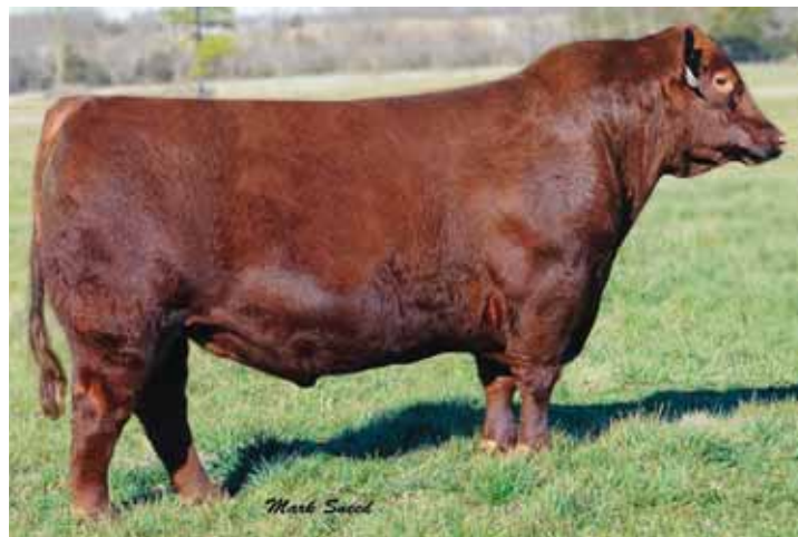
SIRE: Brown JYJ Redemption Y1334

All three females were P.E. to Bar S Clean Sweep 7652.