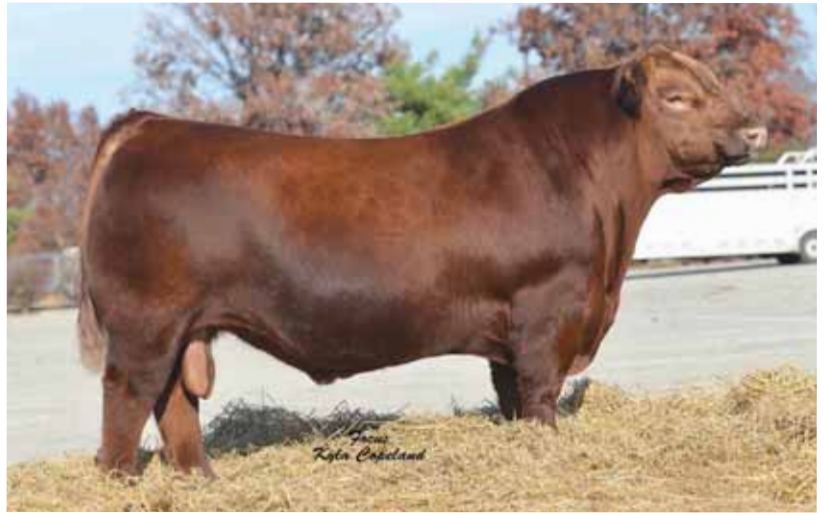
SIRE: Silverias Mission Nexus 1378, sire of Lots 28A & 28B embryos