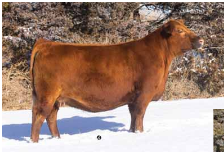
LOT 13A: Bar S Lady 8560