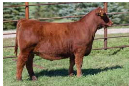
Rust Miss Yankee 940G, the $15,000 full sib to Lot 4B and maternal sib to Varsity Blues and Lot 4A embryos.