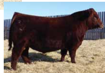
MATERNAL SIB: 718E, a maternal sib to Lot 24A & 24B