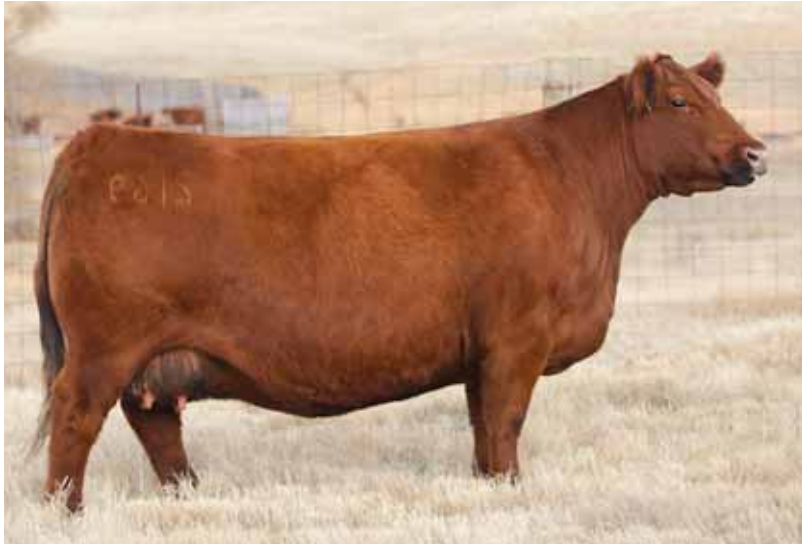
DAM: Red Bar-E-L AB Meg 169Z, dam of Lot 17 embryos