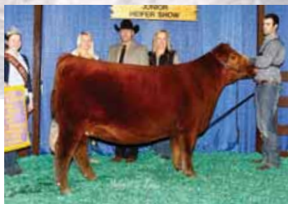
Daughter of Lot 7.