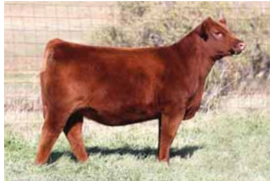
MATERNAL SIB: The $37,500 daughter of the sire to Lot 17 embryos