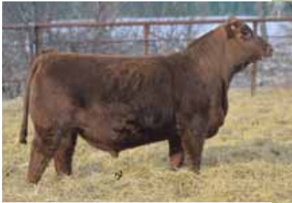
Red Varsity Blues, son of Red U2 Blue Collar 295E.