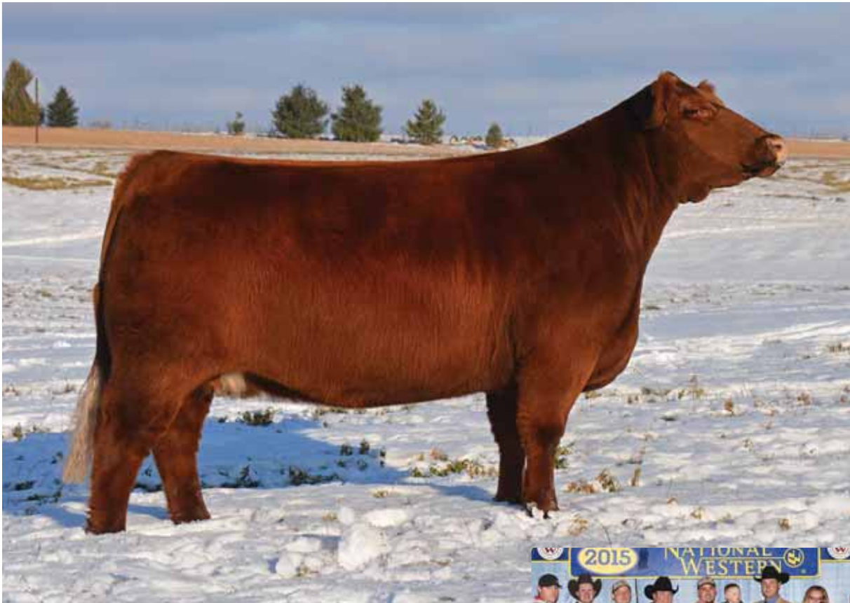
FULL SIB: TLC Alaynah 329. full sib to Lot 16A & 16B

Hands down, these next three lots (14, 15 and 16) are true sale highlights worthy of taking notice of. All three lots are woven together by the ever popular lineage of TLC Alaynah 329. First, Lot 14 is the widely popular many time champion and 2019 American Royal Grand Champion bull, TLC E-Sig 777E, who comes to you in a predictable pedigreed package, is exceptionally well balanced, heavy structured, deep sided, wide topped and muscular. Secondly, Lot 15 - TLC Fight Night 1025F ET, if heavy weight calves at weaning are what trips your trigger, take a look at this big middled, rugged designed, high performance sire sale day - he's quite simply built for the mainstream! Lastly, Lot 16, choice of the right to flush to bull of your choosing on either of the full siblings to the ever popular TLC Alaynah 329 cow! Worthy of noting she has