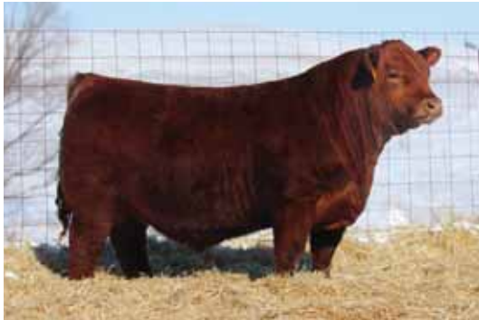
MATERNAL SIB: The $10,000 son of donor dam to Lot 17 embryos.