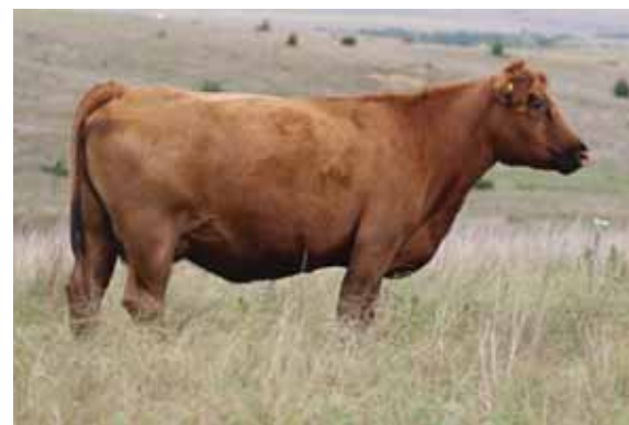
DAM: /S Dixie Lady Conquest 323A