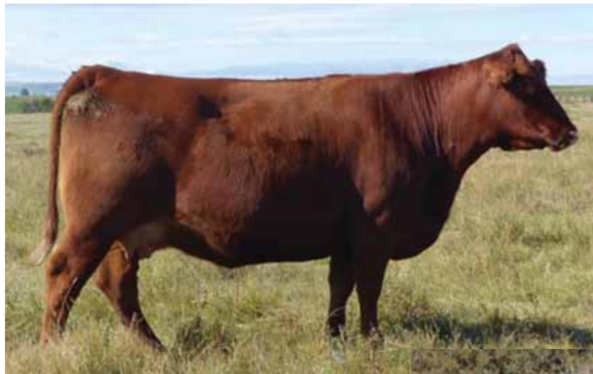
DAM: Cockburn Cora 254Z

Embryos are stored at Boviteq in Wisconsin.