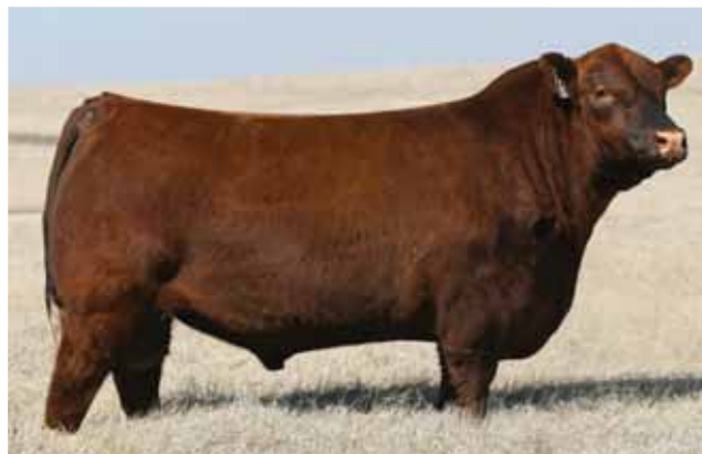
SIRE: MANN Red Box 55C, sire of Lot 20 embryos

The embryos offered in this lot will have the ability to make strides in continuing the legacy of the Red Angus breed. TMAS Firestorm 1800 was one of the most dominant sires in the history of the breed itself. He's influenced so much of the breed's recognition for consistency and unrivaled excellence. Now is your chance to have his elite lineage and reputation added to your program. His dam was the phenomenal GT Cita 4060 female and from the Red Six Mile Sakic 832S bull. DAMAR 101J Blockana A121 is the tremendously elite female to come from the Cloud 9 Cattle Company dispersal. She is unrivaled in terms of a highly sought after and high caliber pedigree. She is a daughter of the great Red Fine Line Mulberry 26P and goes back to the legendary DFRA Blockana 101 donor female. This is your opportunity to invest in some of the best genetics not only in the breed still today, but in the entire industry.