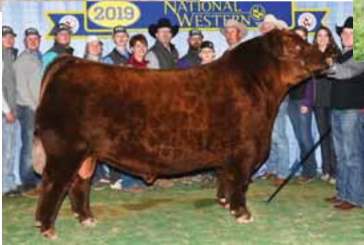
SIRE: KJHT Power Take Off, sire of Lot 8B Embryos