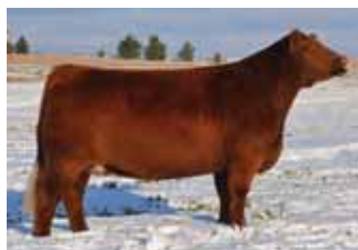
DAM: TLC Alaynah 329, dam of Lot 14 & 15