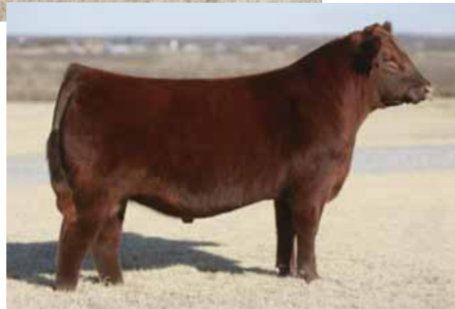
SIRE: PZC TMAS Firestorm 1800 ET, sire of Lot 21 embryos