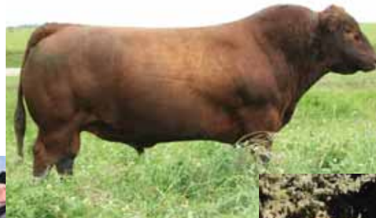
SIRE: Red Ringstead Kargo 215U, sire of Lot 8C Embryos