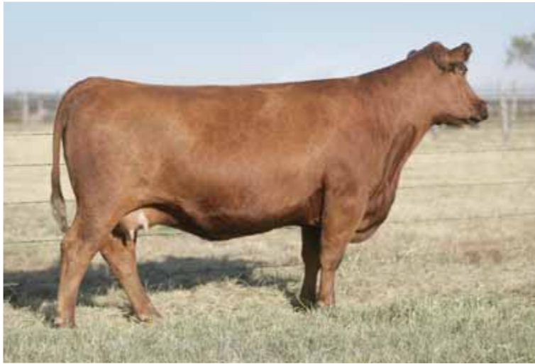
DAM: Red U2 Lass 330W, dam of Lots 28A & 28B embryos