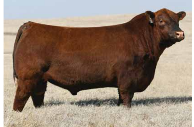
SIRE: MANN Red Box 55C, sire of Lots 17 embryos