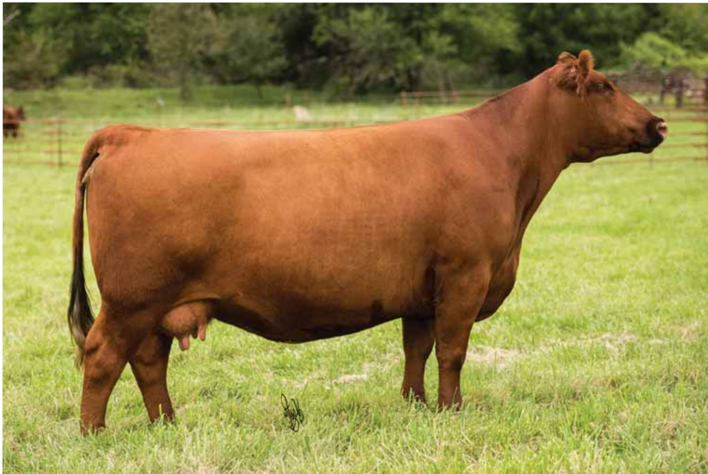
DONOR DAM: MNS Pearle 3121, dam to Lot 22A & 22B embryos and 23 donor