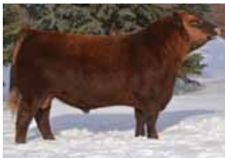
SIRE: Damar Trump C512, sire of Lot 15

LOT 14 - Selling 50% semen interest. Possession negotiable.