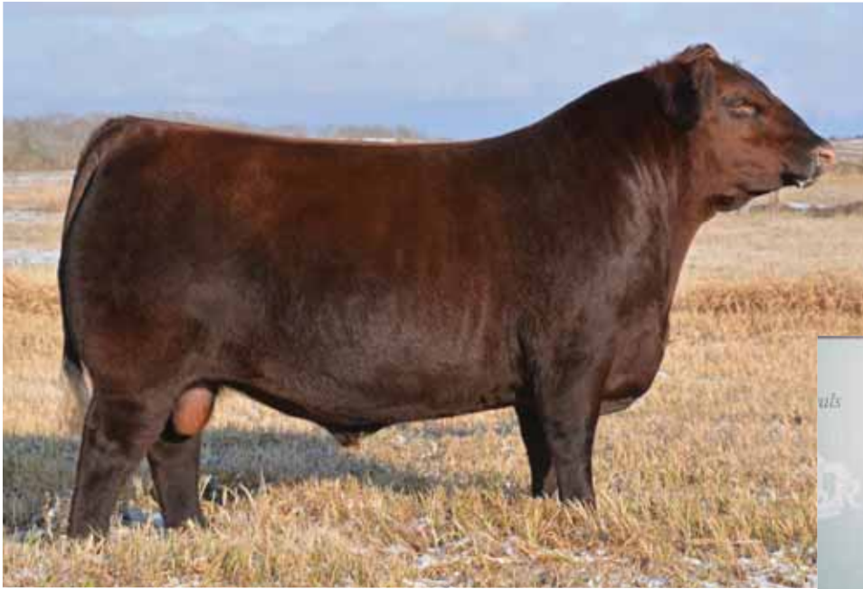
SIRE: Six Mile Signature 295B, sire of Lot 25 embryos