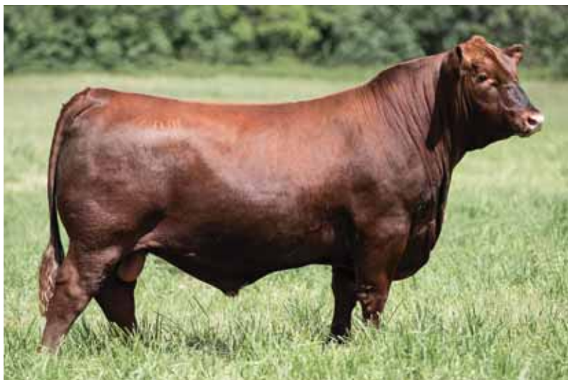
SIRE: Red U2 Blue Collar 295E, sire of Lot 3 & 4A