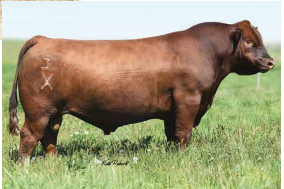
SIRE: HXC Allegiance 5502C