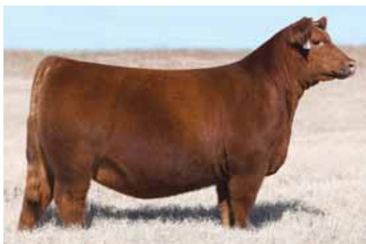
Duff Red Fox 1997, the $71,000 granddaughter of the donor dam.