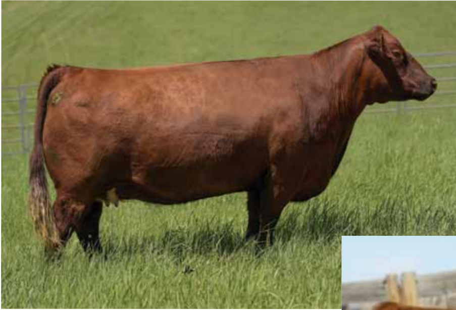
DAM: WR MS Betty 9035