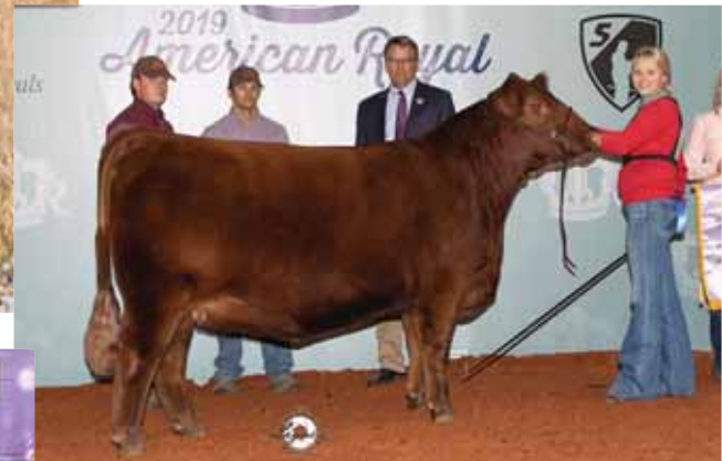
FULL SIB: HB Fantasy, a full sib to Lot 25 embryos