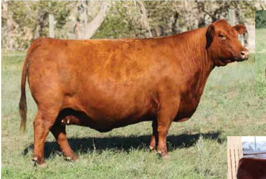
DAM: Red U2 Mabel 60A, dam of Lot 5A & 5B