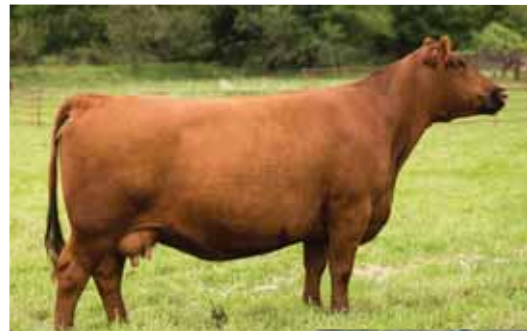
DAM: MNS Pearle 3121