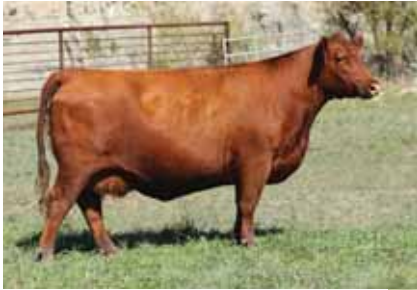
DAM: Red U2 Anexa 439A, dam of Blue Collar