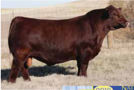
SIRE: Weber Reform, sire of Lot 8A Embryos