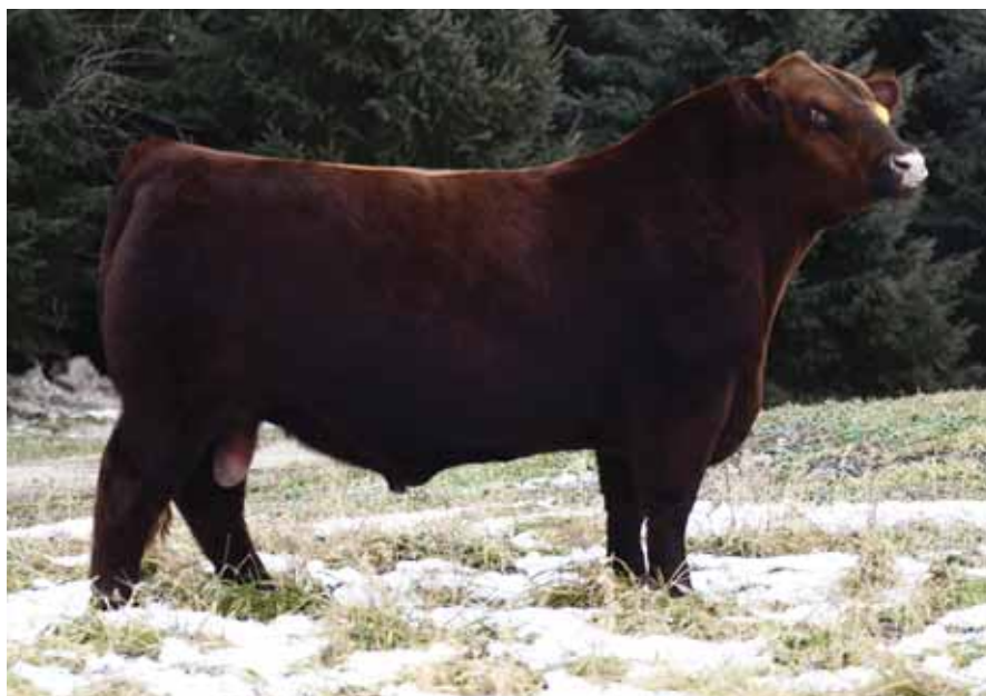
LOT 14: TLC E-Sig 777E

LOT 15 - Selling full possession after 2020 Fort Worth Stock Show and 50% semen interest.