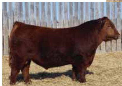
MATERNAL SIB: 624D, a maternal sib to Lot 24A & 24B