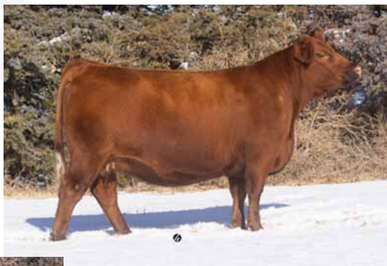
LOT 13B: Bar S Lady 8546