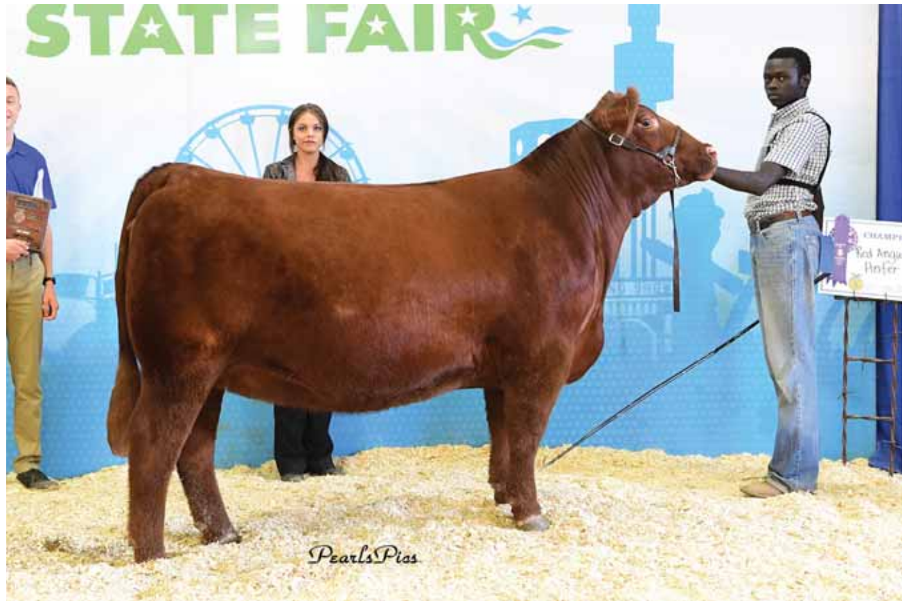
DAM: SWC Robin 767E ET

This unique consignment epitomizes the crossroads of where phenotypic quality and genetic diversity meet. These two packages of three designer embryos offers you the opportunity to invest in a top-of-the-line donor and some of the breed's freshest and best genetics. The sire featured in the embryo portion of this lot is none other than the sound footed, heavy muscled, stout featured and widely popular AI sire, MANN Red Box 55C. He's made his mark in a big way siring scores of stout progeny that are leading the next generation of Red Angus. The donor female is SWC Robin 767E ET who has been admired by many for her flawless structural make up, front end design, body depth and high quality appearance as she's claimed numerous championship banners across the country. We feel these two packages speak themselves and represents the progressive direction of the Lind Family Farms program. Bid with confidence.