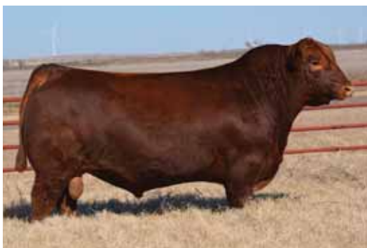
Bingo, the $60,000 maternal sib to Varsity Blues, Lot 3, 4A & 4B embryos.