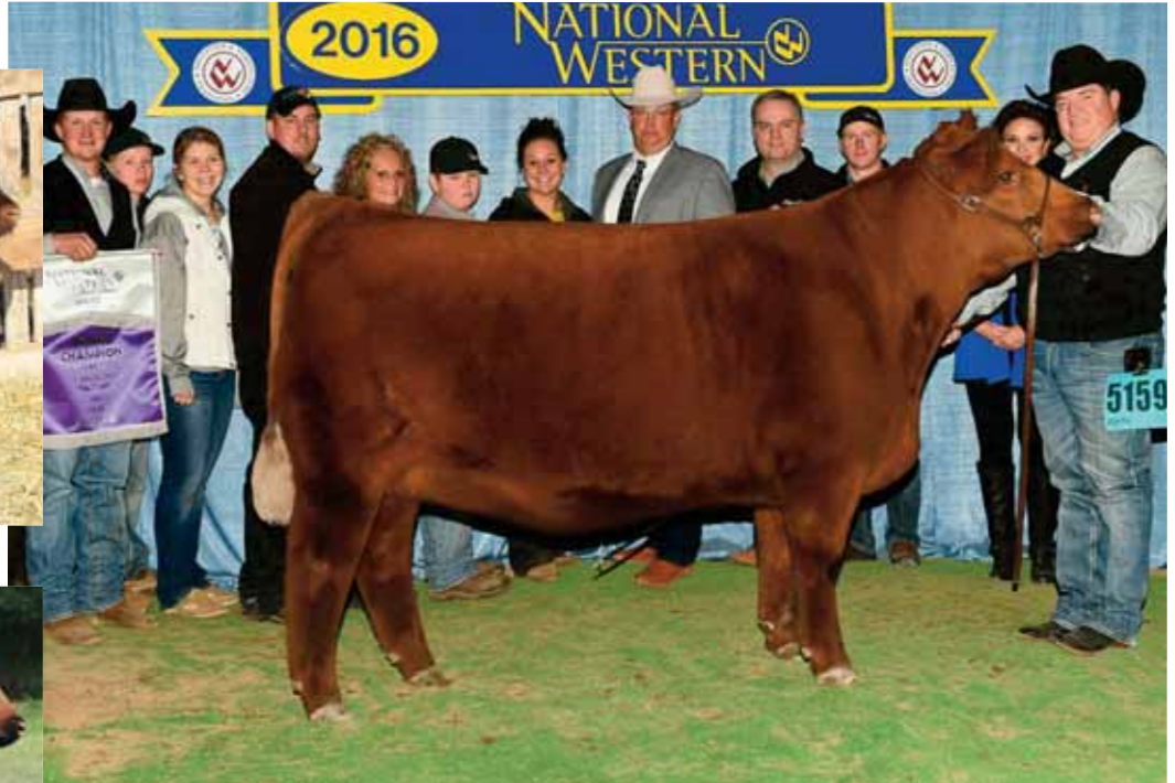
DAM: Red E-L Kassie 129B, dam of Lot 30A & 30B embryos