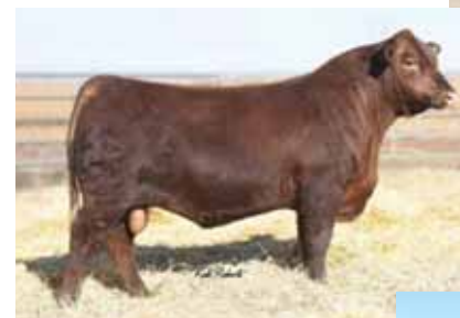
SIRE: Collier Finished Product, sire of Lot 24B embryos