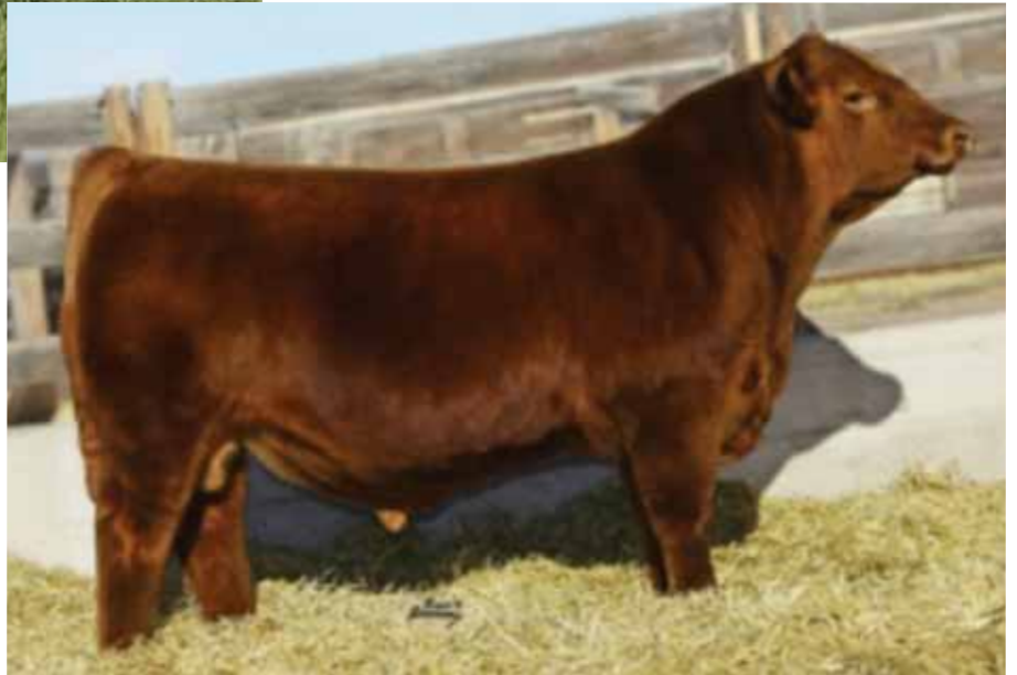
SIRE: WEBR Night Train 324