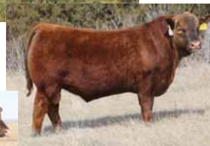
SIRE: REDS Seneca 731C, sire of Lot 24A embryos