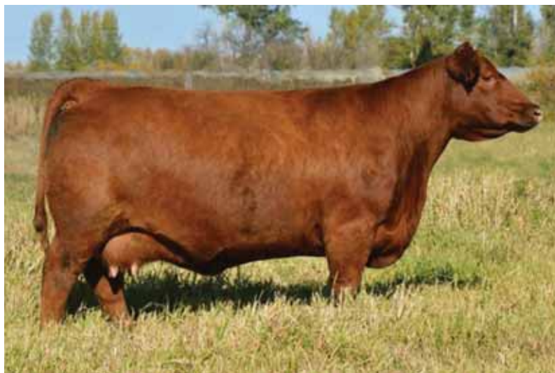
DAM: WSF MS Yankee 13T 12W, dam of Lot 3, 4A & 4B.