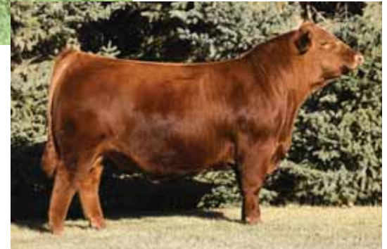
SIRE: Damar Next D852, sire of Lot 8D Embryos