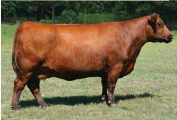
MATERNAL GRANDDAM: Red Bar-E-L Kassie 117X, maternal granddam of Lot 30A & 30B donor dam.