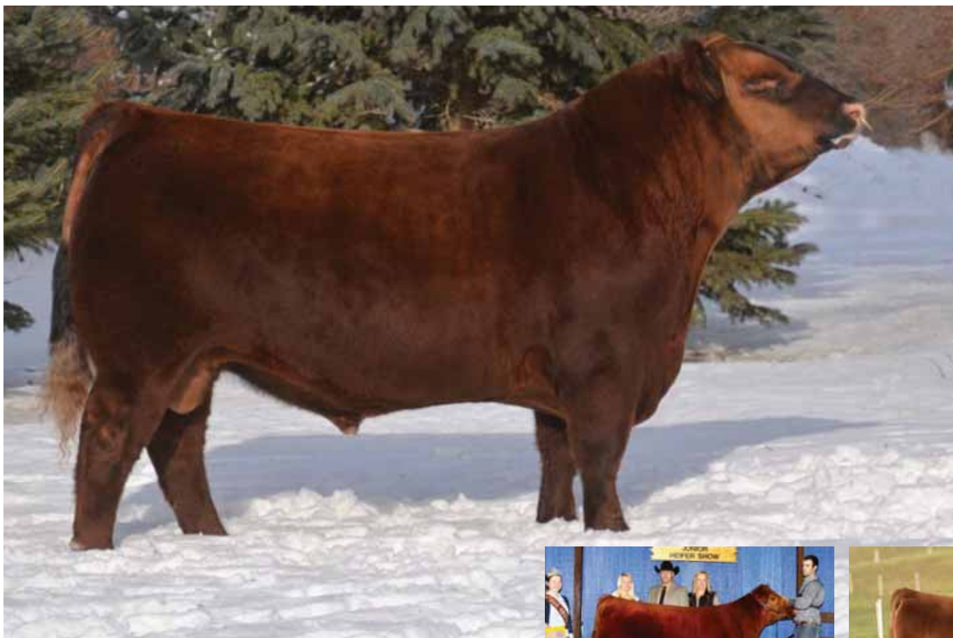
SON: Son of Lot 7, Damar Trump C512