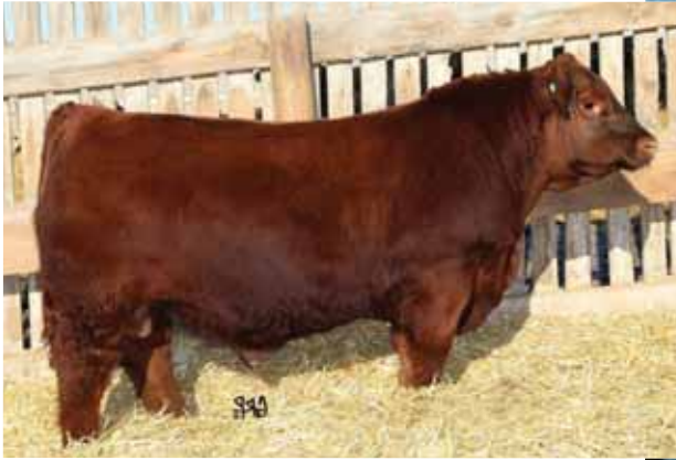
SIRE: Red U-2 Renown 193C, sire of Lot 30A & 30B embryos