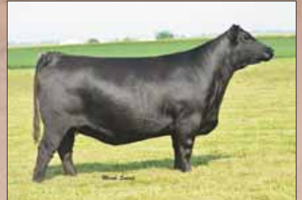
PVF Missie 0084 - The incredible and influential dam of dam of Lot 32.

One of the very best two-year olds ever offered through the PVF Spring Production Sale is this full sister to PVF Missie 8282 who sold as a highlight in 2019.