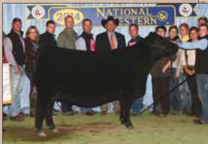
PVF Missie 2018 - This past NWSS Reserve Grand Champion produced to Lot 33.

LOT 33A - Sells with a BULL calf at side born 1/21/20 sired by PVF INSIGHT 0129.