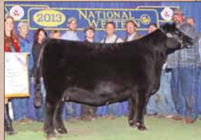
WB PVF Lucy 1052 - This many time champion is the dam of Lot 26.

This fancy daughter of Blacklist is produced from a proven donor dam who was quite successful herself being named Grand Champion Bred and Owned Female at a past National Junior Angus Show and was also selected Reserve Grand Champion at the National Western Stock Show. In addition, her dam is also a maternal sister to the dam of Lot 22 in this offering.