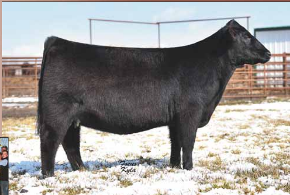
Lot 33 « PVF Missie 8016