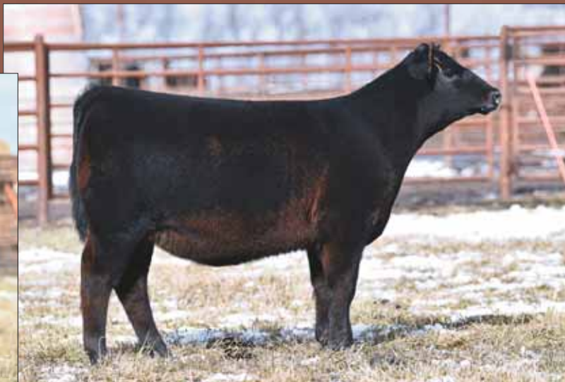
Lot 8 « PVF Missie 9238