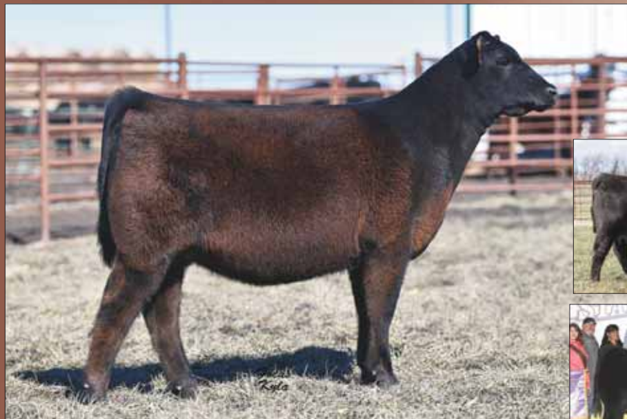
Lot 17 « PVF Blackbird 9232

PVF Blackbird 7022 - This Illinois State Fair Grand Champion is a maternal sister to Lots 16 & 17.