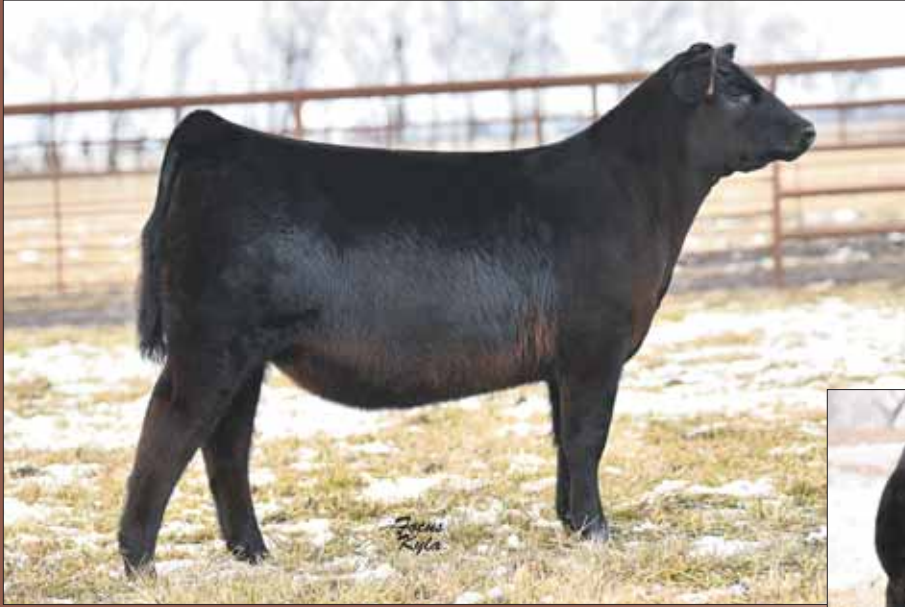
Lot 20 « PVF Blackbird 9245