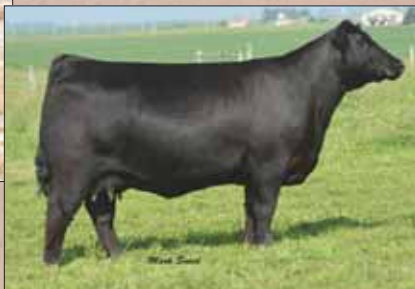
PVF Blackbird 3070 - This dam of PVF Blacklist 7077 is also the dam of Lots 18 & 19.