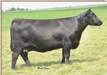
PVF Missie 1148, dam of Lot 11.

A stout made, long-bodied daughter of Conley Express in this late September born female whose dam is a maternal sister to PVF Insight 0129. She is also a maternal sister to the influential PVF donor, PVF Missie 0084, who has direct daughters and several granddaughters included in this offering. Additionally, a maternal sister, PVF Missie 4137, was selected Supreme Champion Female at a past Houston Livestock Show.