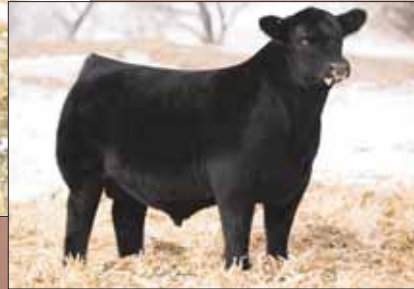
WB Pendleton 708 PVF SWSN, sire of Lot 20.