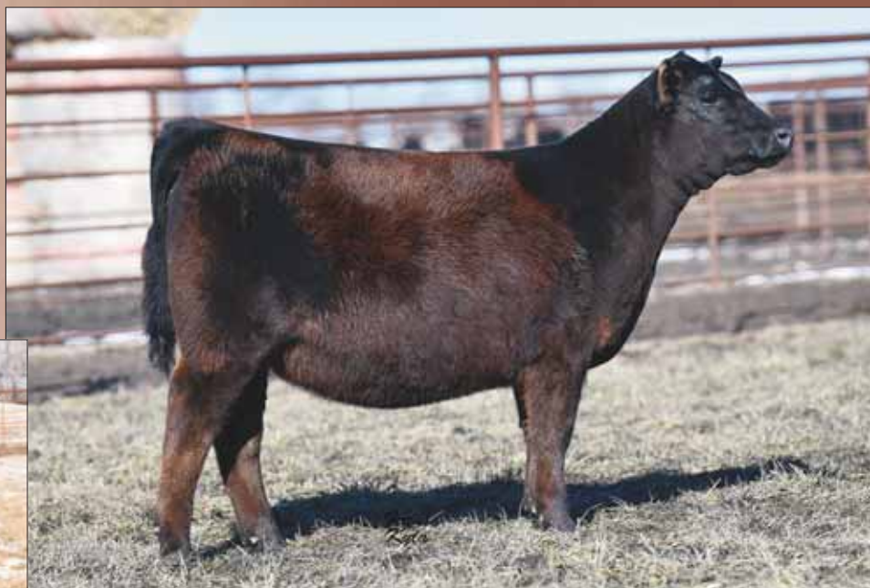
Lot 15 « PVF Princess 9256