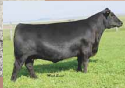
Dameron PVF Proven Queen 010, the maternal granddam of Lot 24.