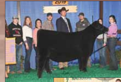
PVF Proven Queen 8256 is the maternal sister to Lot 13 and has enjoyed a phenomenal show career for Cameron Choate.