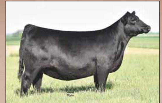
PVF Missie 6311, this dam of Lot 2 enjoyed a very successful show career.