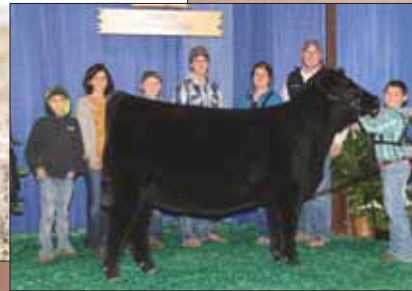
PVF Proven Queen 5250, dam of Lot 28.