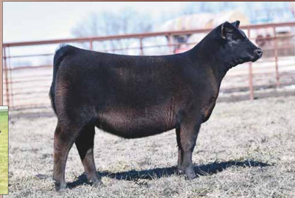
Lot 11 « PVF Missie 9251