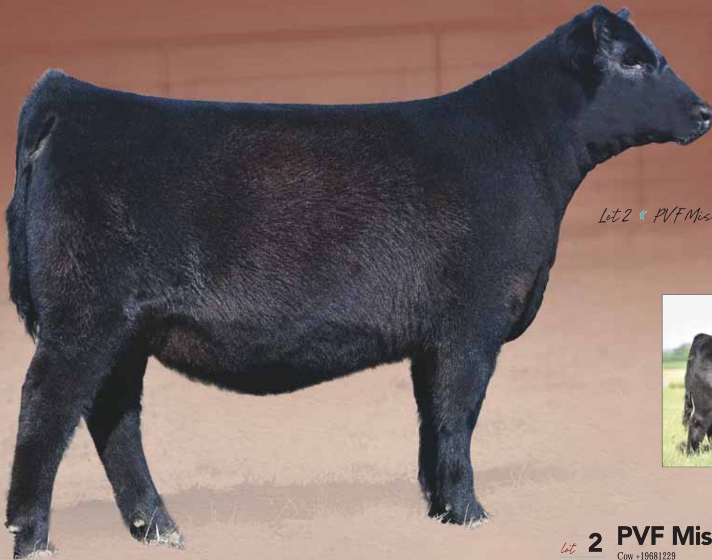
Lot 2 « PVF Missie 9244