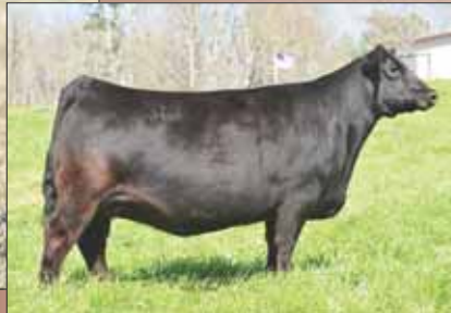
E/T Blackcap 304, the dam of Lot 21.