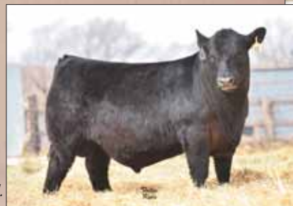
ECR Resource 623, sire of Lot 44.

A grandson of the proven Pathfinder sire in the Genex line-up, SAV Resource 1441, produced from a dam by McKinley who is a direct daughter of PVF Missie 0084. In addition, his dam is a maternal sister to the past NJAS Grand Champion, PVF Missie 4149.