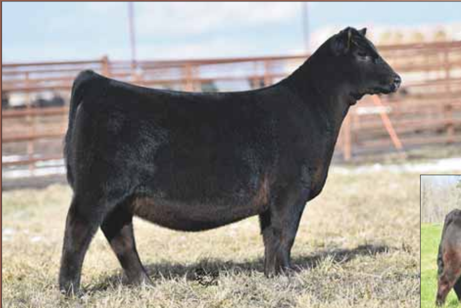
Lot 21 « PVF Blackcap 9237

This daughter of Pendleton will be a crowd favorite sale day as she exhibits a great deal of eye appeal and style. She is produced from a young dam by Primo who is a maternal sister to PVF Blackbird 3127 and in addition, PVF Blackbird 7001 is a maternal sister to Hoffman H/G Blackbird 620 who was selected as the 2017 NJAS Grand Champion Female.