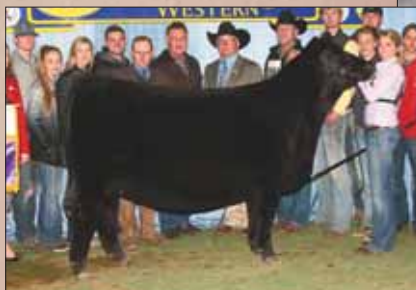
T/R NFF Princess E307, this NWSS Grand Champion is a full sister to Lot 14.

Her dam is also the dam of Lot 15, a direct daughter of the past NWSS Champion, Princess 1012.