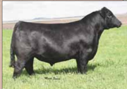
PVF Surveillance 4129, sire of Lots 29, 30 & 31.

A pedigree combining the PVF herd sire, PVF Surveillance 4129, with the highly maternal Blackbird cow family and produced from a dam bred in the Topline program who combines the popular traits of Raptor and Look Out in her pedigree.