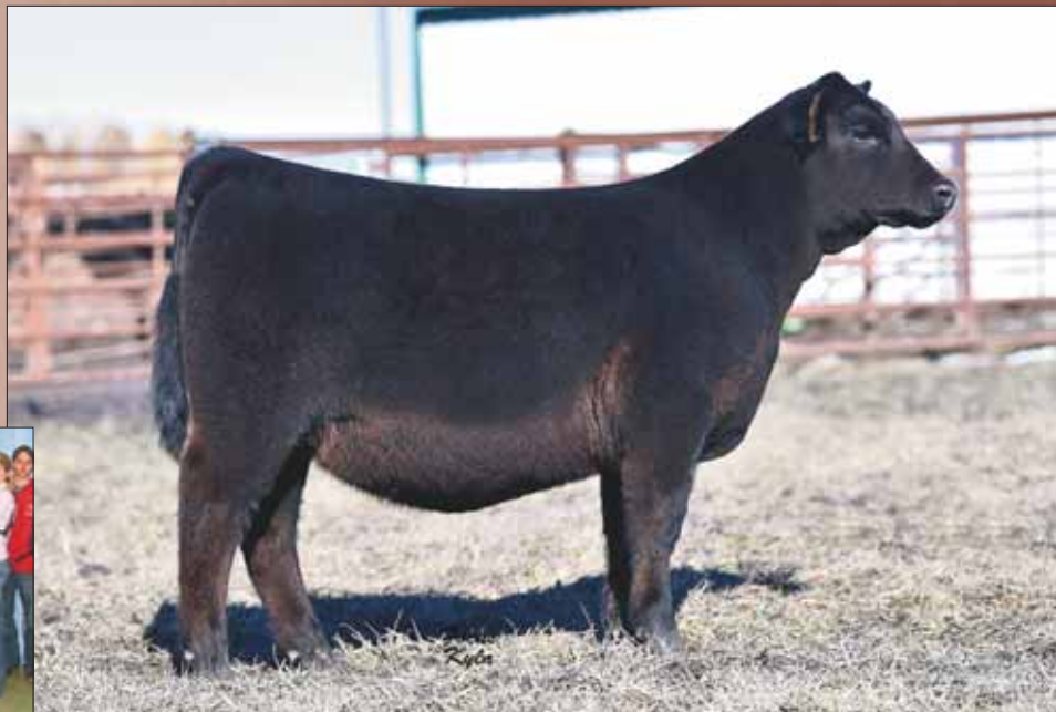
Lot 14 « PVF Princess 9258