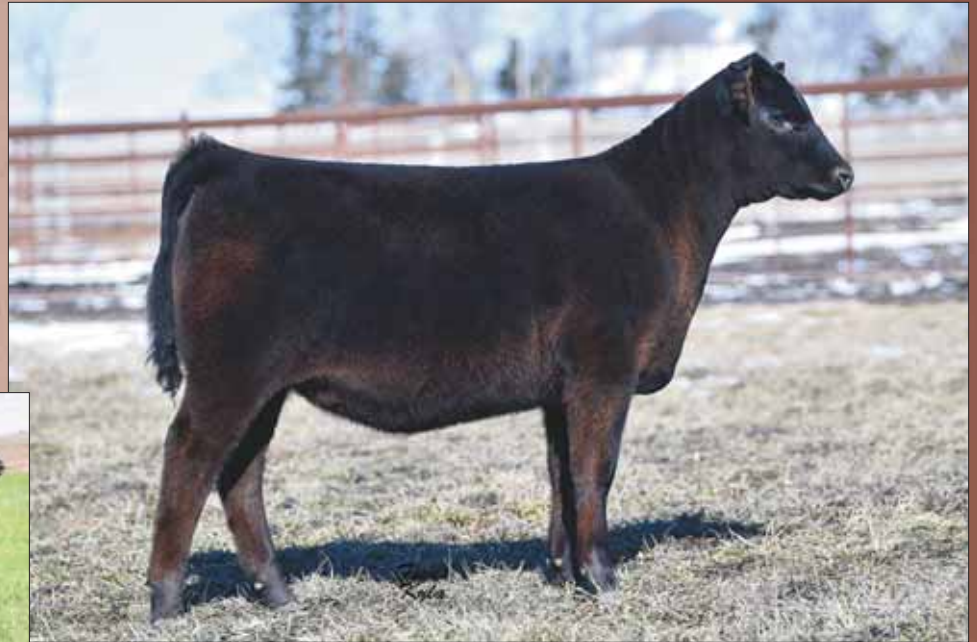
Lot 30 « PVF Blackbird 9260