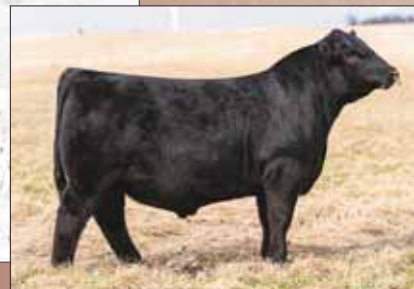
PVF TCF Frozen 6078, sire of Lot 42.