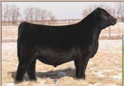
PVF Blacklist 7077, his maternal sisters sell as Lots 18 & 19.