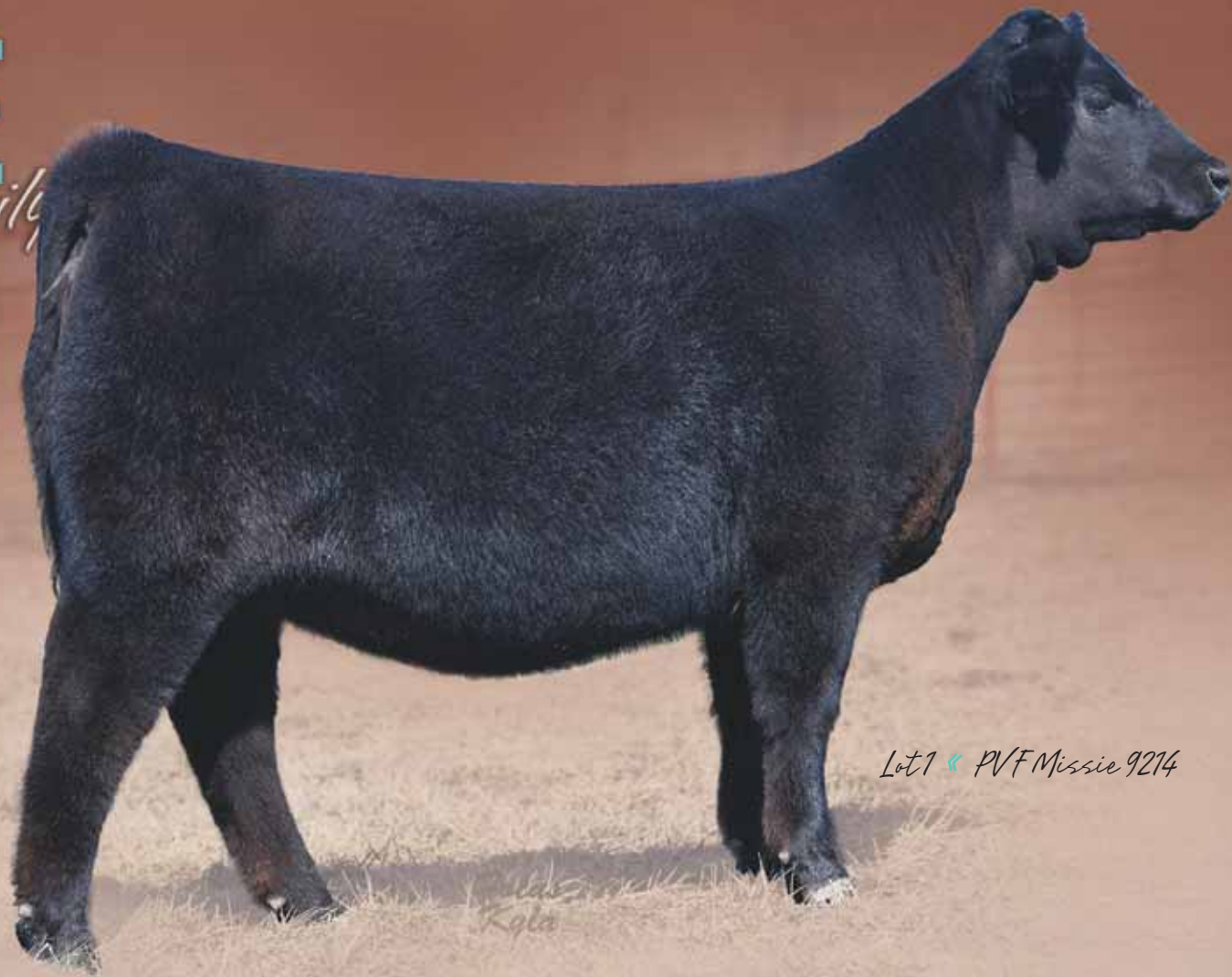
Lot 1 « PVF Missie 9214