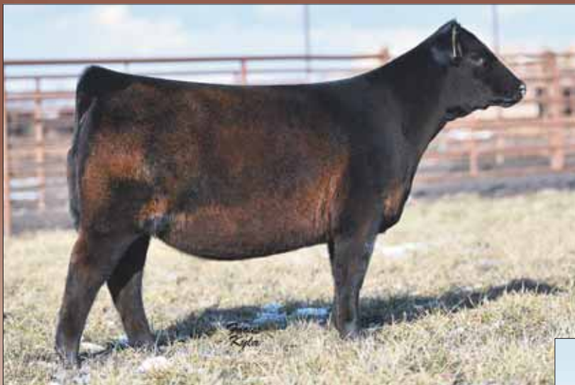
Lot 5 « PVF Missie 9233