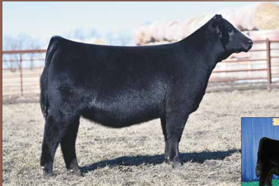
Lot 25 « PVF Proven Queen 9215

Her dam by the popular Genex sire, PVF Insight 0129, is a direct daughter of the great foundation PVF donor, Proven Queen 010. PVF Proven Queen 5094 is a full sister to females who have been selected Division Champions at the National Junior Angus Show and have been extremely competitive for many PVF customers.