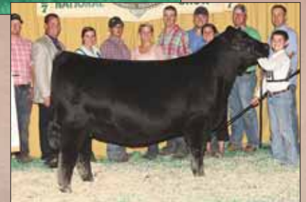
PVF Proven Queen 5250, dam of Lot 13 and past Atlantic National Reserve Grand Champion.