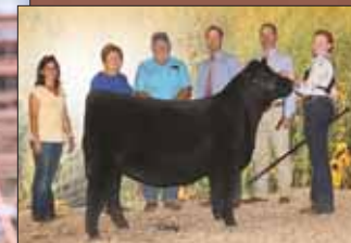
PVF Missie 8246 - This maternal sister to Lots 8, 9, and 10 was selected Reserve Grand Champion at the Illinois State Fair Junior Angus Show.