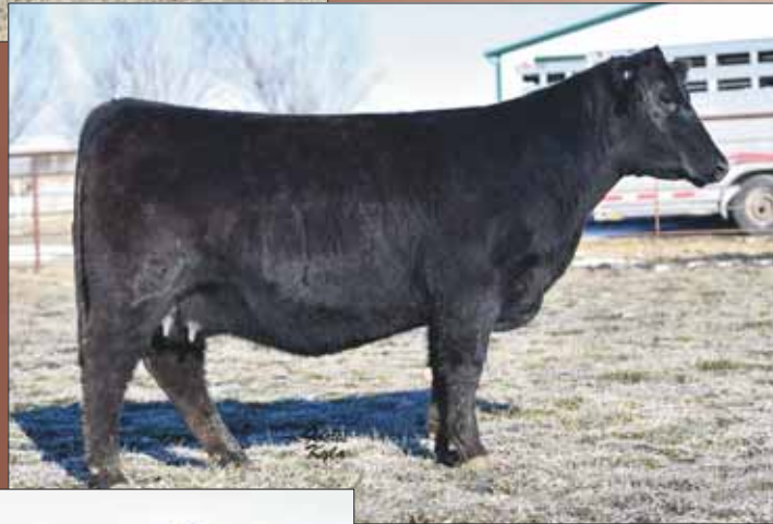
Lot 36 « PVF Missie 8166