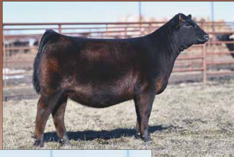
Lot 6 « PVF Missie 9247