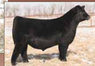
PVF The Natural 7042, sire of three outstanding daughters Lots 8, 9 and 10.