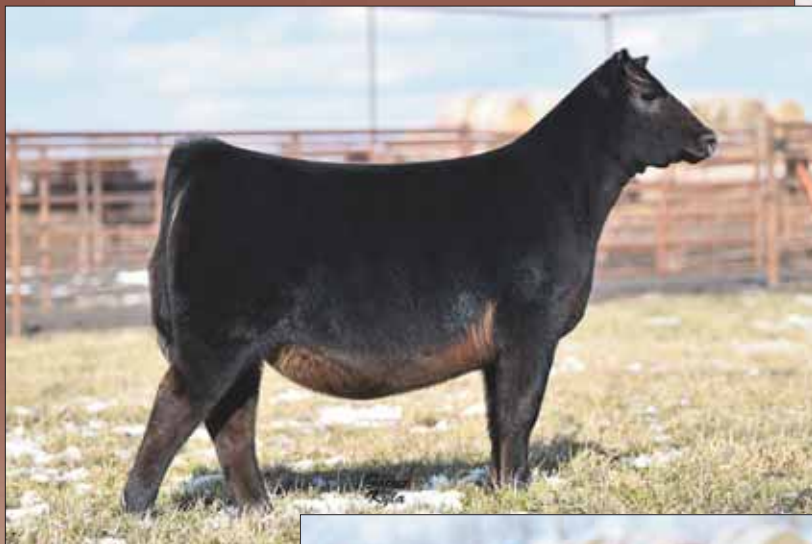
Lot 9 « PVF Missie 9239