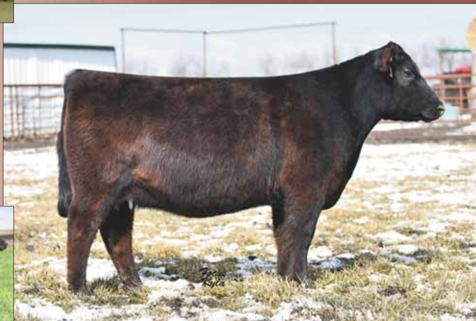
Lot 34 « PVF Blackbird 8036