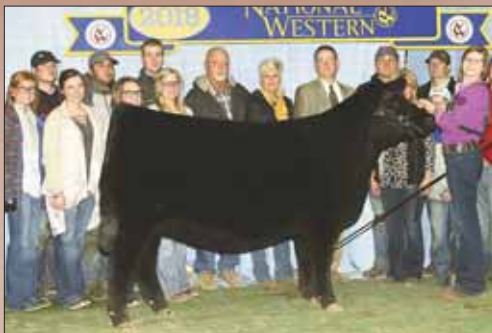
PVF Missie 6228, The dam of Lot 1 and the past National Western Stock Show Reserve Grand Champion Female.