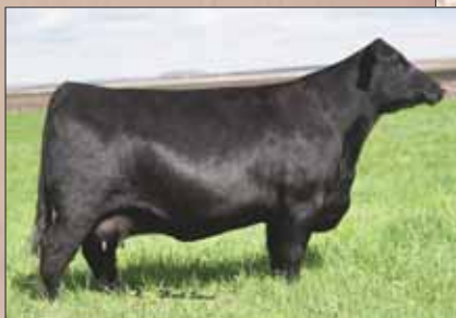
PVF Blackbird 1167, dam of Lot 34.

LOT 34A - Sells with a BULL calf at side born 1/24/20 sired by STEVENSON TURNING POINT.