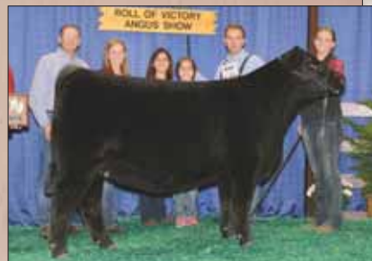
PVF Proven Queen 3175, a maternal granddam of Lot 27.

PVF Proven Queen 3175 was one of several direct daughters of the foundation donor, Proven Queen 010 sired by PVF Insight 0129, who were selected champions from coast to coast including being named Division Champions at the National Junior Angus Show.