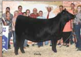
PVF Blackbird 7113, a maternal sister to Lot 16.