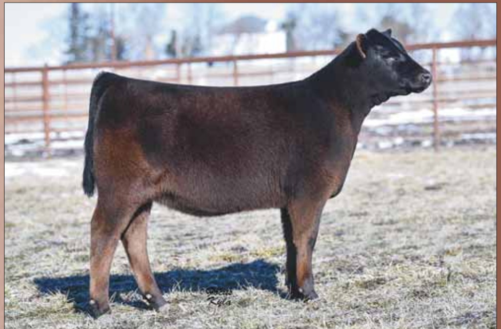
Lot 31 « PVF Blackbird 9270

She combines the popular PVF Surveillance 4129 with a dam representing multiple generations of proven PVF Blackbird females.