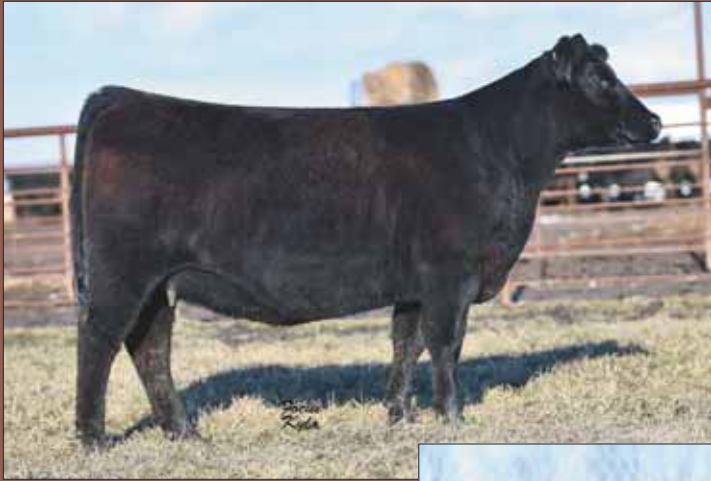
Lot 35 « PVF Missie 8191