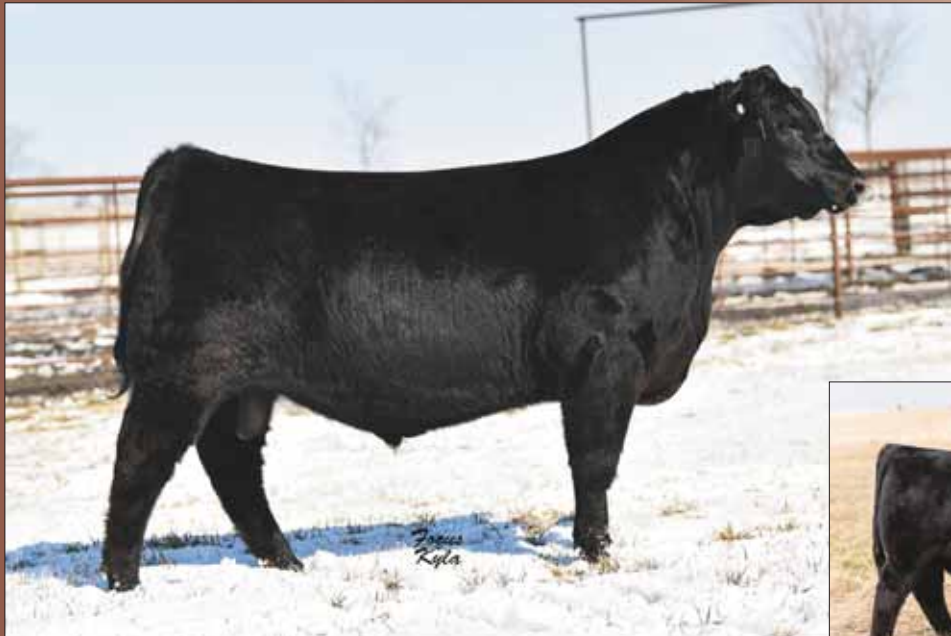
Lot 42 « PVF Frozen 9067