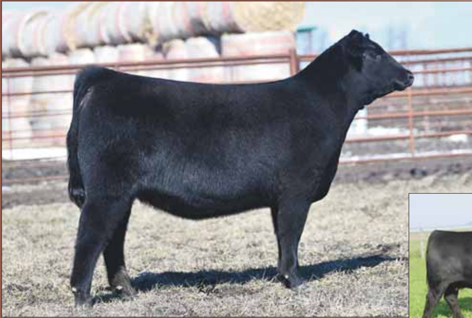
Lot 24 « PVF Proven Queen 9211