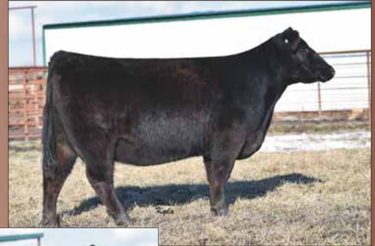
Lot 38 « Eathington Georginia 205F

LOT 38A - Sells with a BULL calf at side born 02.01.20 sired by Stevenson Turning Point.