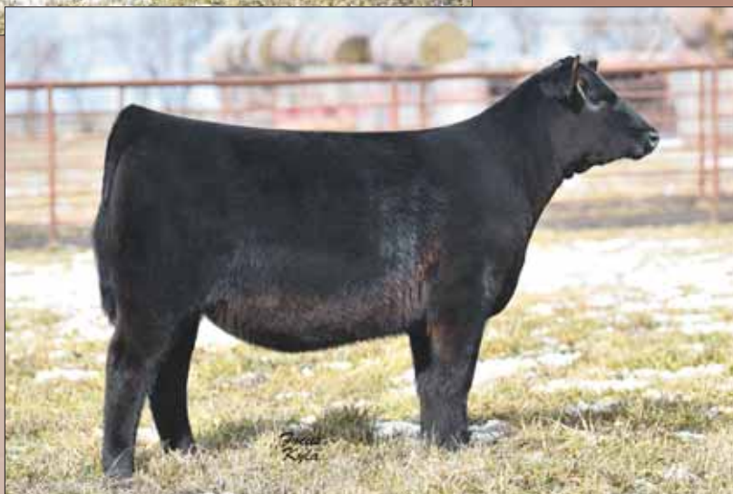
Lot 10 « PVF Missie 9241

Retaining half embryo interest in Lots 8, 9 & 10.