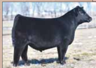
PVF Marvel 9185

Her dam is a direct daughter of the great PVF Missie 0084, who was selected as a Division Champion at the National Western Stock Show.