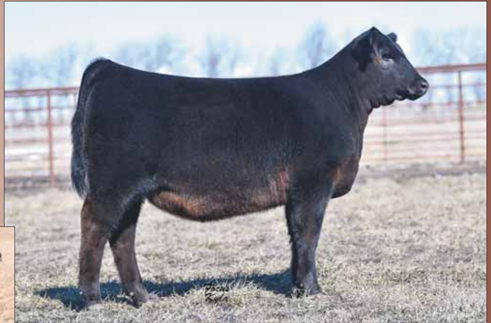
Lot 22 « PVF Lucy 9220