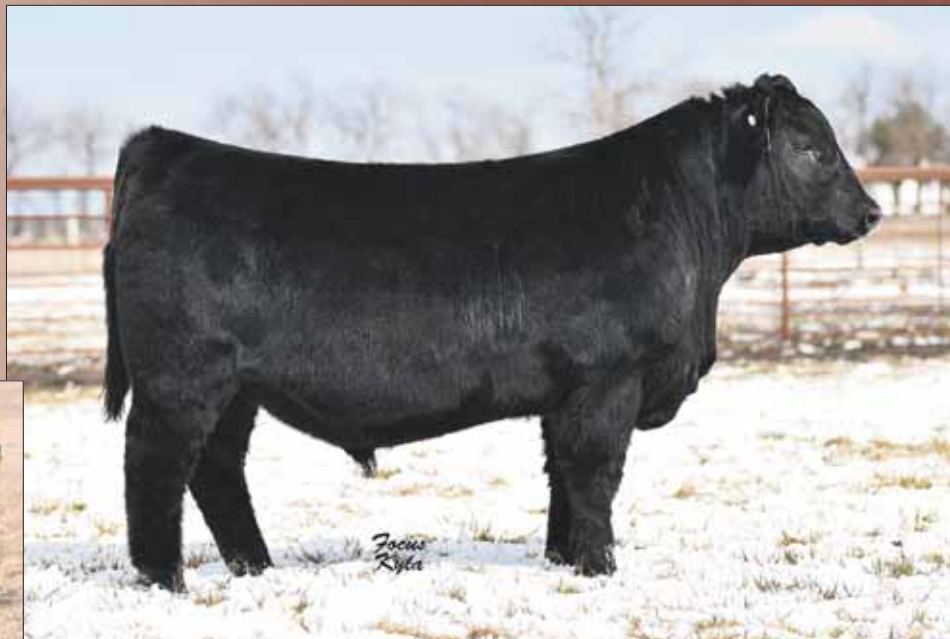
Lot 43 « PVF Inauguration 9107