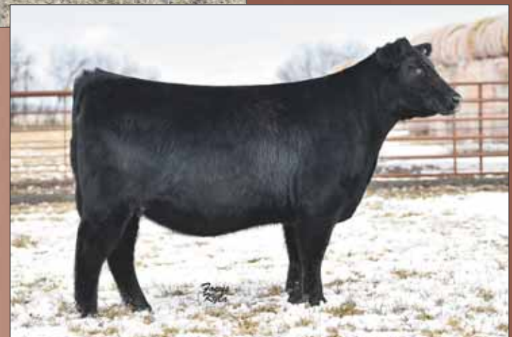
Lot 40 « PVF Proven Queen 8059

Will sell with a calf at side (Lot 40A) sired by SCHIEFELBEIN WARRANTY.