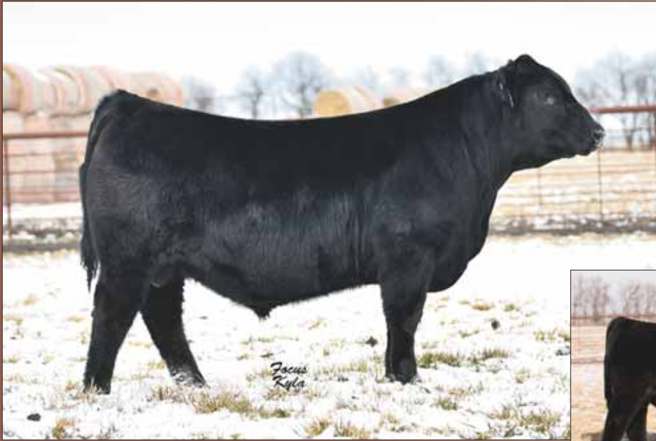
Lot 41 « PVF TC Blacklist 9130