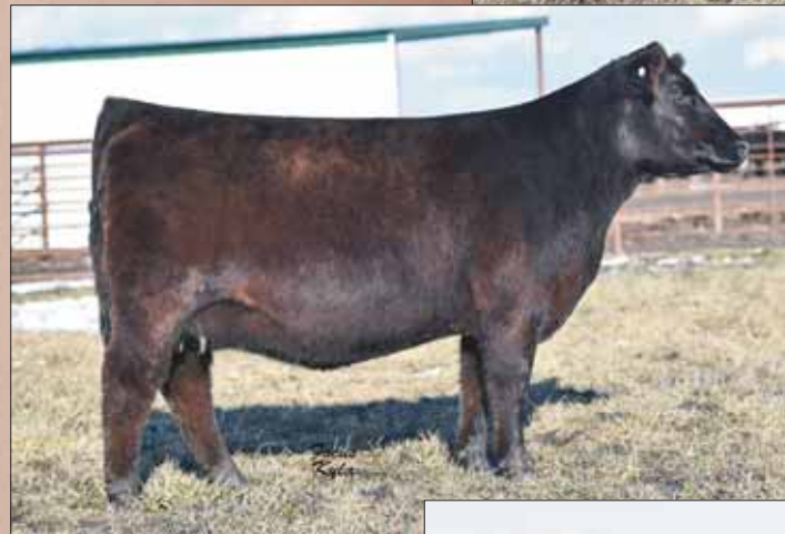
Lot 39 « PVF Proven Queen 8048

LOT 39A - Sells with a BULL calf at side born 2/5/20 sired by STEVENSON TURNING POINT.