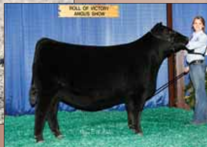
PVF Proven Queen 6150, the maternal sister of Lot 25