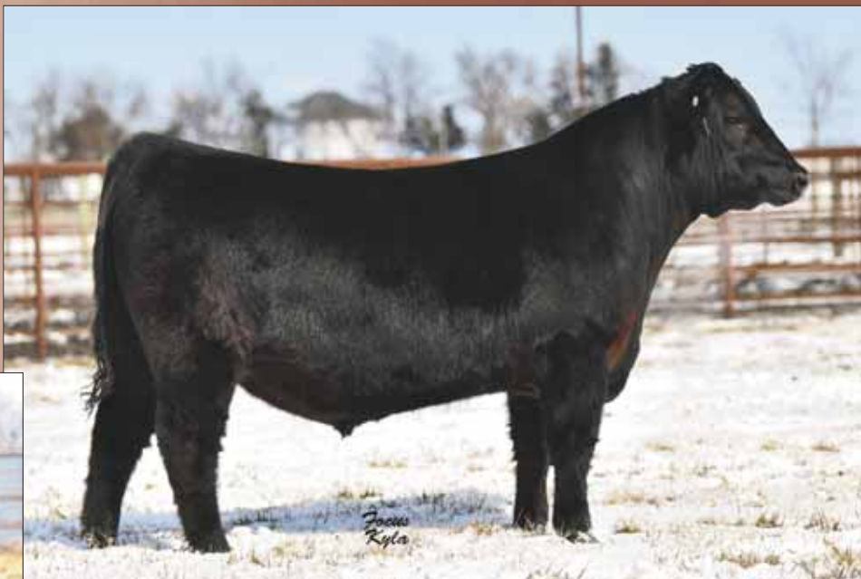
Lot 44 « PVF Eventide 9070