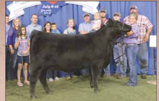
PVF Missie 3078, this past NJAS Division Champion is a maternal sister to PVF Insight 0129 and the dam of Lot 3.

Lot 3 PVF Missie 9223 Cow 19665526 tattoo: 9223 calved: 09.03.19