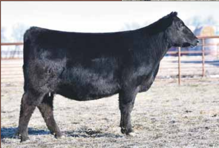
Lot 37 « PVF Lucy 8141