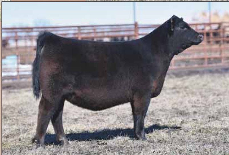
Lot 7 « PVF Missie 9254

lot 5 PVF Missie 9233 Cow +19665532 tattoo: 9233 calved: 09.15.19