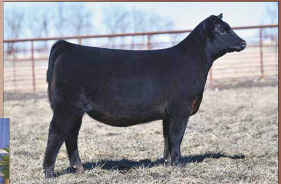
Lot 27 « PVF Proven Queen 9216