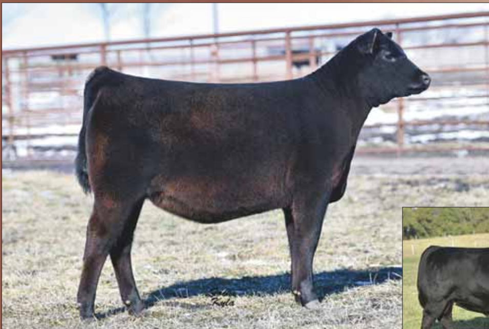
Lot 29 « PVF Missie 9253

One of the youngest heifers in the sale is this attractive daughter of Pendleton produced from PVF Proven Queen 5250, who was a many times champion. Another maternal sister to PVF Proven 5250 is the past Illinois Angus Futurity Champion, PVF Proven Queen 6151.