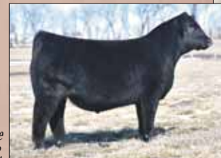
PVF Reddington 9186

These two PVF star herd sires are maternal brothers to Lot 12.