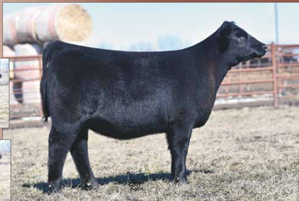
Lot 12 « PVF Missie 9212

These two PVF star herd sires are maternal brothers to Lot 12.