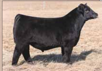
PVF Inauguration 6174, sire of Lots 22 & 23.

Her dam is a full sister to PVF Visionary 3082. The dam of this heifer is a direct daughter of Thomas Lucy 7360, who has produced many incredible daughters for PVF, including the past NWSS Reserve Grand Champion, WB PVF Lucy 1052, the NWSS Division Champion, PVF Lucy 4106, the $35,000, PVF Lucy 1041 and the $29,000, PVF Lucy 3061, along with multiple other sale features in past sales.