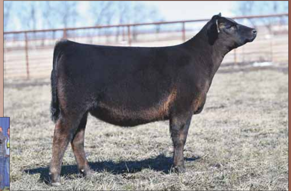
Lot 26 « PVF Lucy 9230