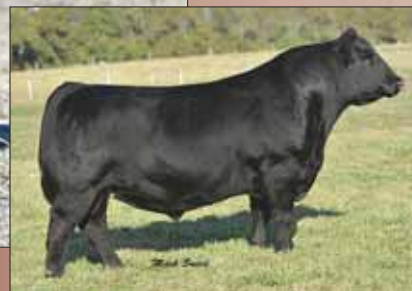
PVF Insight 0129, this proven Genex sire is a full brother to the dam of Lot 29.