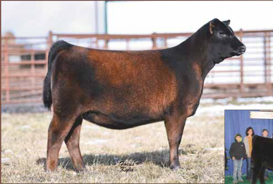
Lot 28 « PVF Proven Queen 9263