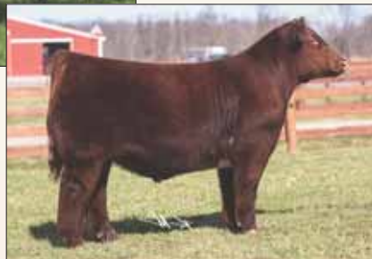
TRN Omaha 79, sire of Lot 2 pregnancy.