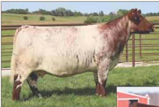
Little Cedar Augusta Pride 701 ET, dam of Lot 2 pregnancy.