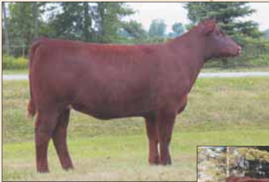
Little Cedar Margie 1520 ET, dam of Lot 1 pregnancy.