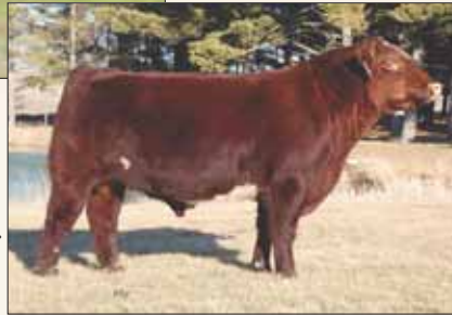
FREE K-Kim Hot Commodity, sire of Lot 1 pregnancy.