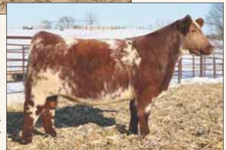
SULL Perfect Travels 4556, dam of Lots 17A, B & C.

We are offering choice of our three Picture Perfect heifers. Our experience with Picture Perfect females is that they are soft and sound in a broody, deep body. These sisters are no exception. Picture Perfect females have stood the test of time in many of the top breeding farms and when you see these sisters, you'll understand why. Their maternal sister sold in last year's sale and has done very well for our friend Hunter Lehman.