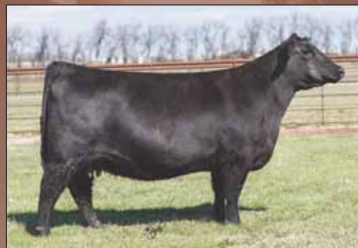
PVF MISSIE 3078, DAM OF LOT 25