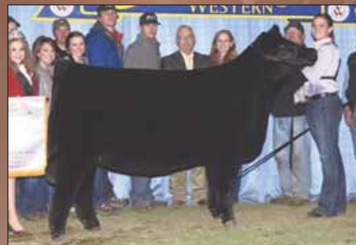
PVF MISSIE 4149, DAM OF LOTS 21 & 22