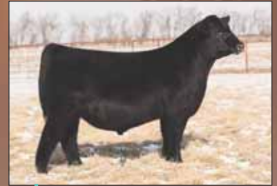
PVF THE NATURAL 7042, SIRE OF LOT 27