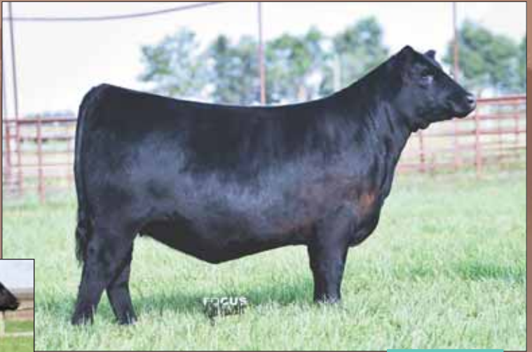
PVF PROVEN QUEEN 4032, DAM OF LOT 46