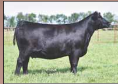
PVF MISSIE 5245, DAM OF LOTS 13, 14, 15 & 16.

Two exciting maternal sisters to PVF Marvel 9185 and PVF Reddington 9086, who were selected by Select Sires and ABS and were features of our 2020 Spring Sale. The dam of these females is a daughter of the legendary PVF Missie 0084 and was a past North American International Livestock Exposition and National Western Stock Show Division Winner. 0300 is flawless in her design and impeccable in her structure, while 0304 adds extra stoutness and power to a beautiful pattern.