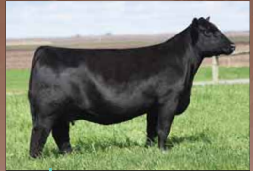
PVF PROVEN QUEEN 4032, DAM OF LOT 17