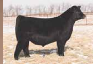
PVF THE NATURAL 7042, SIRE OF LOT 1