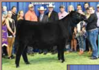
HOFFMAN H/G BLACKBIRD 720, MATERNAL SIB TO LOT 2