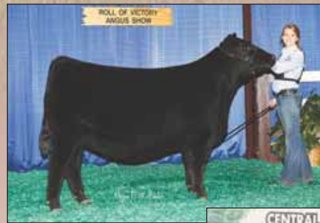
PVF PROVEN QUEEN 6150, this NAILE division winner is a daughter of PVF Proven Queen 3033.