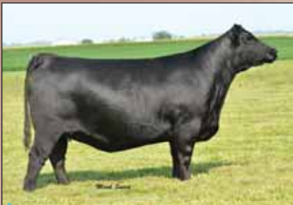
PVF MISSIE 0084, DAM OF LOTS 7, 8, 9 & 10