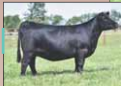
PVF MISSIE 6298, DAM OF LOTS 28 & 29