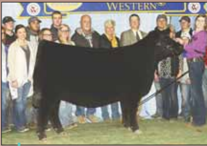
PVF MISSIE 6228, DAM OF LOT 12