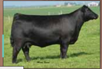
PVF BLACKBIRD 3070, DAM OF LOT 1