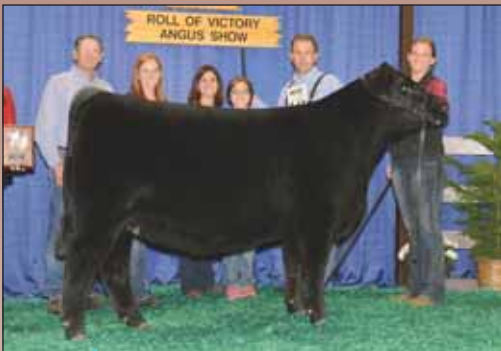
PVF PROVEN QUEEN 3175, DAM OF LOT 18