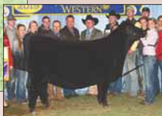
TIR NFF PRINCESS E307, MATERNAL SISTER TO LOT 32

This maternal sister to the 2019 Grand Champion Female at the National Western Stock Show is from the Princess cow family who has created so many champions for the Express Ranch Program. This female offers exceptional length and muscle shape with a beautiful front end.