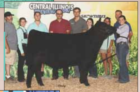
PVF PROVEN QUEEN 9126, this Grand Champion of the 2020 Central Illinois Preview Show is a daughter of PVF Proven Queen 3033.