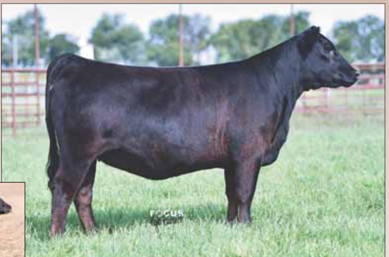
PVF INAUGURATION 6174, SIRE OF LOT 48