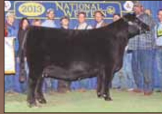
WB PVF LUCY 1052, DAM OF LOTS 30 & 31