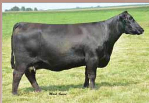
PVF MISSIE 1148, DAM OF LOT 26.