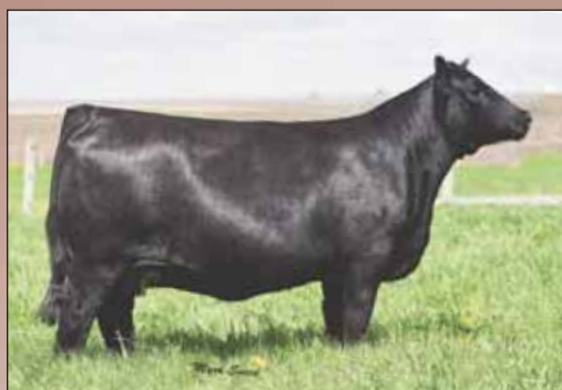
PVF MISSIE 4149, DAM OF LOTS 21 & 22