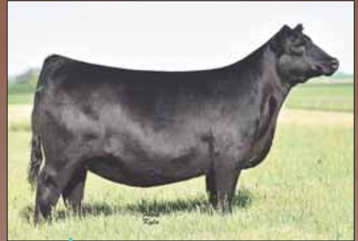
PVF MISSIE 6311, DAM OF LOTS 23 & 24