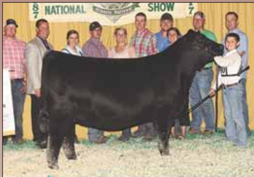
PVF PROVEN QUEEN 5250, DAM OF LOTS 19 & 20