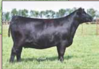
PVF MISSIE 5245, DAM OF LOT 50.