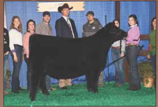
PVF PROVEN QUEEN 8256, FULL SISTER TO LOT 19