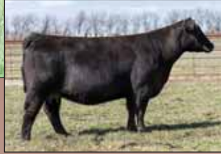
PVF BLACKBIRD 3127, DAM OF LOT 49