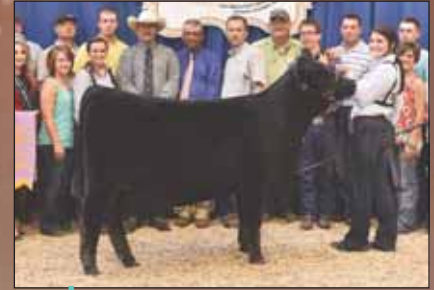
PVF MISSIE 5216, FULL SISTER TO LOT 9