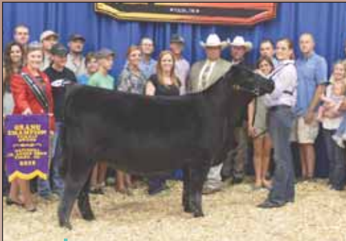
PVF MISSIE 4149, FULL SISTER TO LOTS 7 & 8