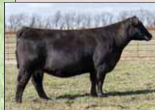
PVF BLACKBIRD 3127, DAM OF LOT 39