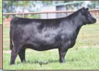
PVF BLACKBIRD 7001, DAM OF LOTS 37 & 38