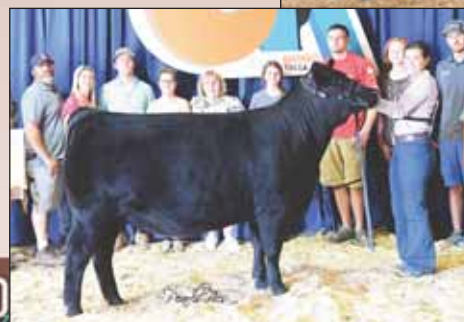
PVF PROVEN QUEEN 9126, Reserve Division Winner from the 2020 NJAS is a daughter of PVF Proven Queen 3033.