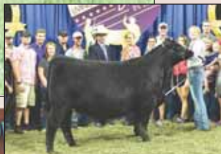
PVF BLACKCAP 6313, MATERNAL SISTER TO LOT 51.