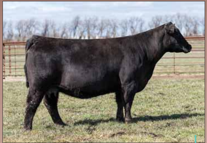
PVF BLACKBIRD 3127, DAM OF LOTS 3, 4, 5 & 6