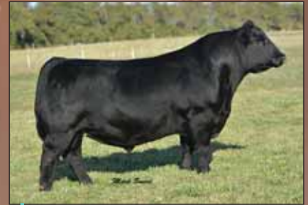
PVF INSIGHT 0129, A MATERNAL SIB TO LOT 11