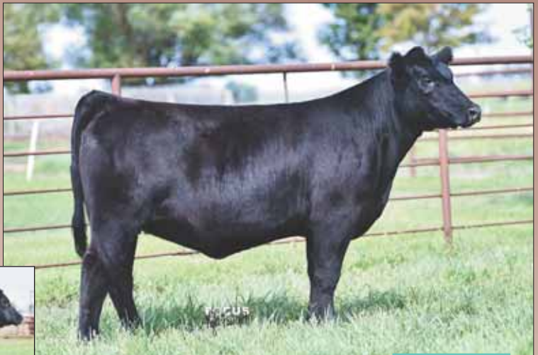
PVF PROVEN QUEEN 3033, DAM OF LOT 47.