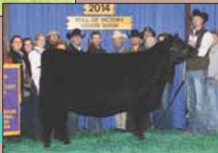
PVF BLACKBIRD 3071, MATERNAL SIB TO LOT 2