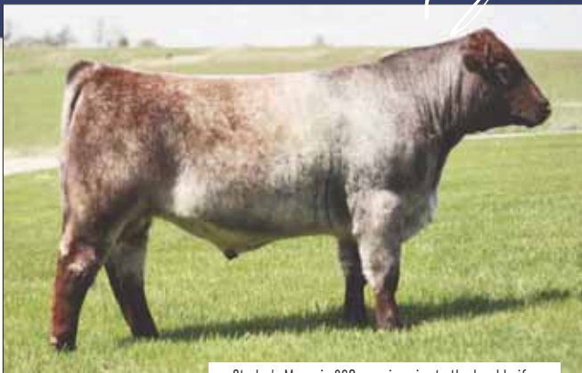
Studer's Marquis 86G, service sire to the bred heifers.