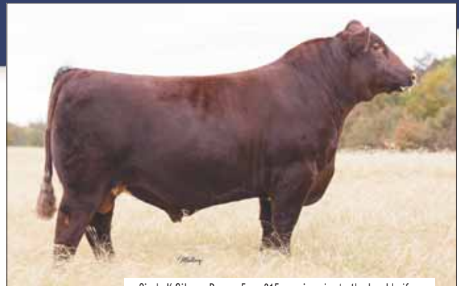
Circle K Gilman Dream Easy 21F, service sire to the bred heifers.