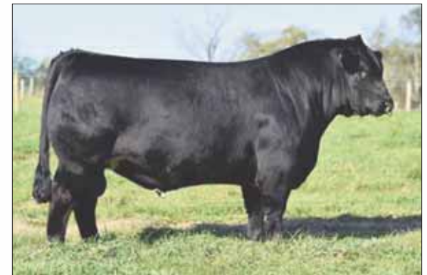
CJSL Dauntless, Lot 1B sire.