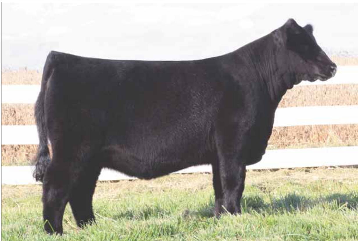
Lot 12 ~ ATAK Honey ET

Selling full possession and 50% embryo interest.