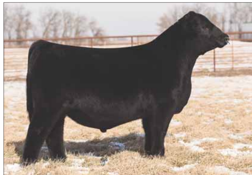
PVF Blacklist 7077, Lot 35 sire.

A combination of one of the hottest Angus sires on the market today, PVF Blacklist and the influence of CFLX Robinette 070E makes this genetic offering a no-brainer to have at the very top of your shortlist on sale day. KLS Farms of Chatham, LA is offering four conventional heifer embryos from this mating that will be 37.5% and double homozygous. PVF Blacklist has always been a crowd favorite since his debut in Denver and he is rapidly making his way to the top of numerous breeds in the industry today. PVF Blacklist is a son of the one and only SAV Brilliance 8077 and is out of one of Prairie View Farms' top Dameron First Class donor females, PVF Blackbird 3070. His grand-dam, ALL PVF Blackbird 645 produced the 2017 National Junior Angus Show Grand Champion Female. CFLX Robinette 070E is a daughter of GPFF Blaque Rulon and out of a breed matriarch, BOHI Red Robin 282R. Her storied pedigree is impacting breeding programs throughout the industry today and will continue to do so for years to come. These genetics speak volumes of the potential that comes from blending two phenomenal individuals and creating future heifer calves that will soon be taking the world by storm.