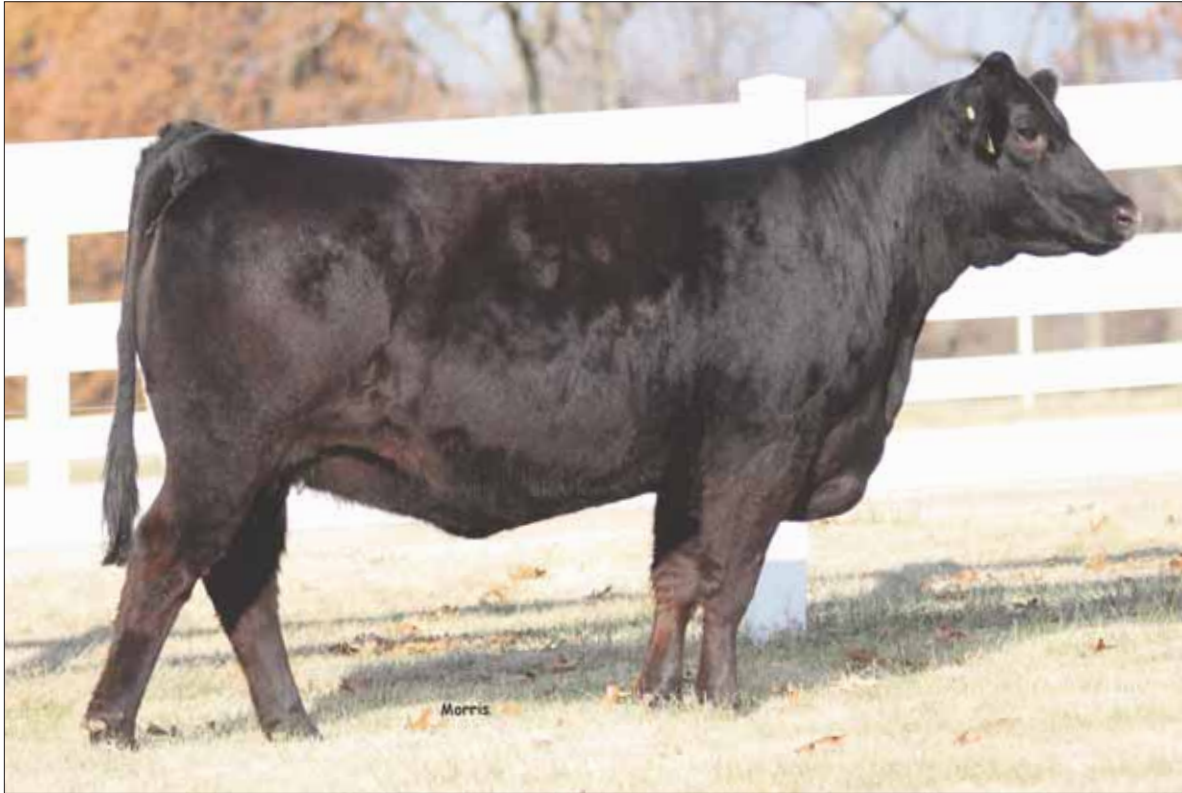
CFLX Robinette 070E ET, Lot 31 dam.