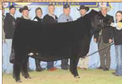
Rivestone Charmed, maternal granddam to Lot 7.