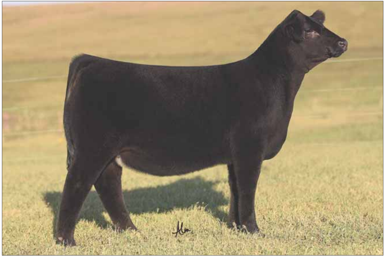
The $201,500 Ratliff Howaboutit 008H selling to Sara Sullivan of Dunlap, Iowa