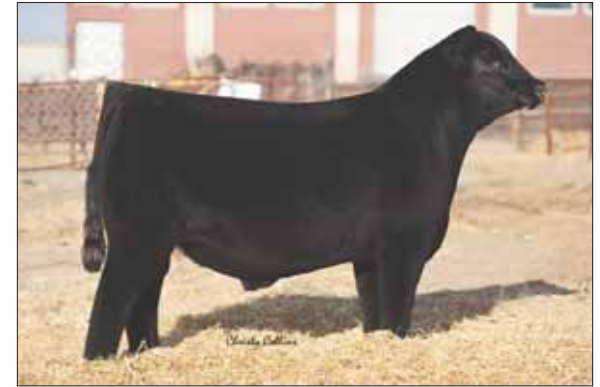
Silverias Style, Lot 1A sire