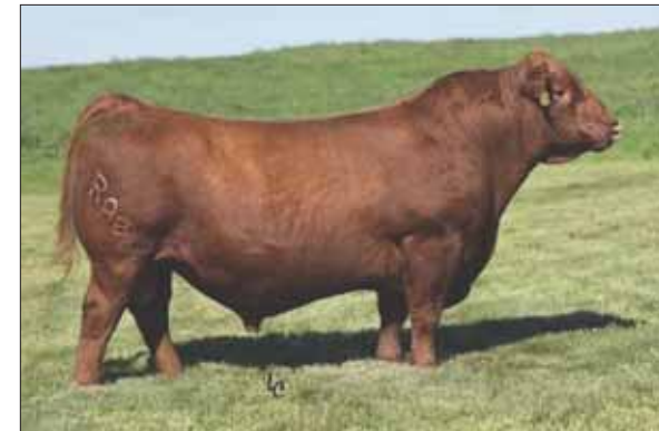
Bieber Hard Drive Y120, Lot 31 sire.

Retaining the right to one flush at buyer's connivence and seller's expense.