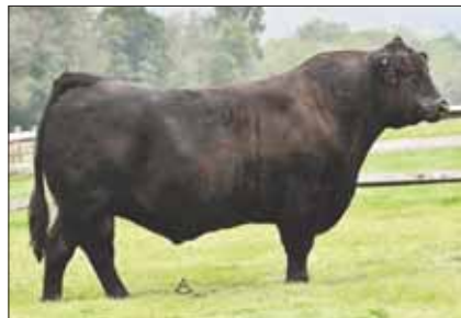
CJSJ Creed, sire of Lot 9 Pick.