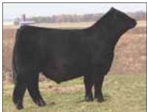
SSTO Guns N Roses, Lot 38A sire.

ELCX Kings Landing 599D ET is another individual with a stunning presence in the Limousin breed. He was the 2018 North American International Livestock Exposition Grand Champion Bull exhibited by Edwards Land & Cattle, White Valley and Wies Limousin Ranch. He is a double homozygous son of MAGS Xyloid and out of the one and only WLR Prada donor female. This mating will be a great opportunity to find out what this blend of elite genetics will do for you! This sexed heifer embryo will be 65.5% Lim-Flex and homozygous polled.