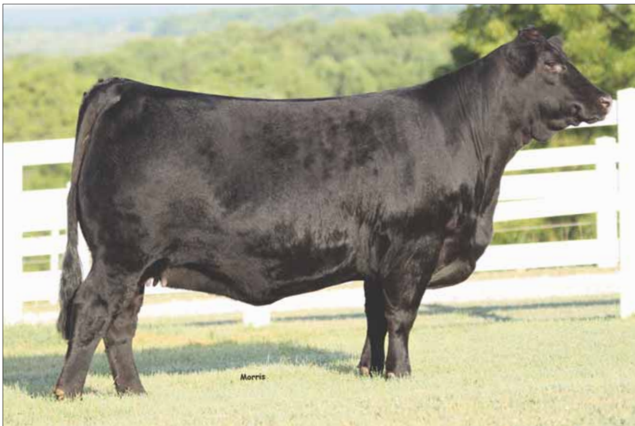
MINO Fiona ET, Lot 25 donor.