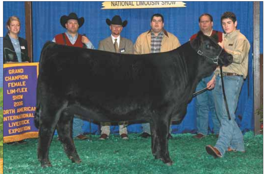
BOHI Red Robin, donor dam of Lot 9 Pick.