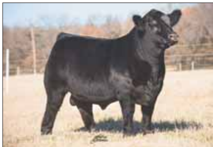
SSTO Best Bet, sire of Lot 9 Pick.