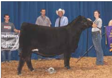
JSZC TSSC Larissa 49G, 2020 National Junior Show Grand Champion Lim-Flex Female

LOT 1A - Retaining the right to one flush at buyer's connivence and seller's expense.