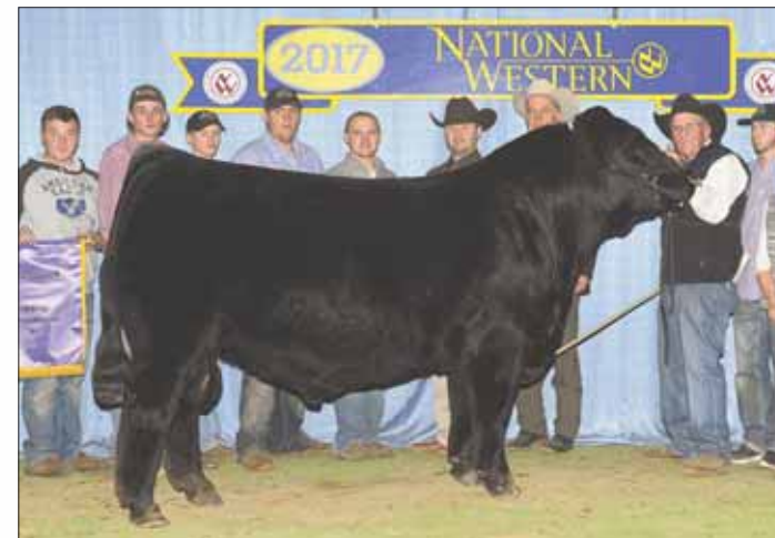
TASF Crown Royal 960C, sire of Lot 26.

When Edwards Land & Cattle Co. told us their plan to consign these embryos to this sale offering- we almost didn't believe them! These four conventional embryos will be from the highly prolific mating of TASF Crown Royal 960C and AUTO Poem 273Y. TASF Crown Royal 960C is the DHVO Deuce son that is one of the most popular Limousin bulls in the breed. His dam is TASF Whiskey Lullaby 357W, a leading donor in the Thomas & Son Farms lineup. She is a daughter of EXLR Nasdaq 380R. AUTO Poem 273Y is the incredibly powerful donor of Edwards Land & Cattle Co. She is a daughter of SAV Bismarck 5682 and from the great MAGS Phantoms Prize donor. AUTO Poem 273Y is the dam of the 2016 All American Limousin Futurity Supreme Champion Bull, ELCX Bulletproof and ELCX Cabin Fever 273C, the 2017 All American Limousin Futurity Grand Champion Bull. The four embryos in this consignment will be 75% Lim-Flex, homozygous polled and double black. Once again, we are thrilled to have these embryos consigned by Edwards Land & Cattle Co. of Beulaville, NC.