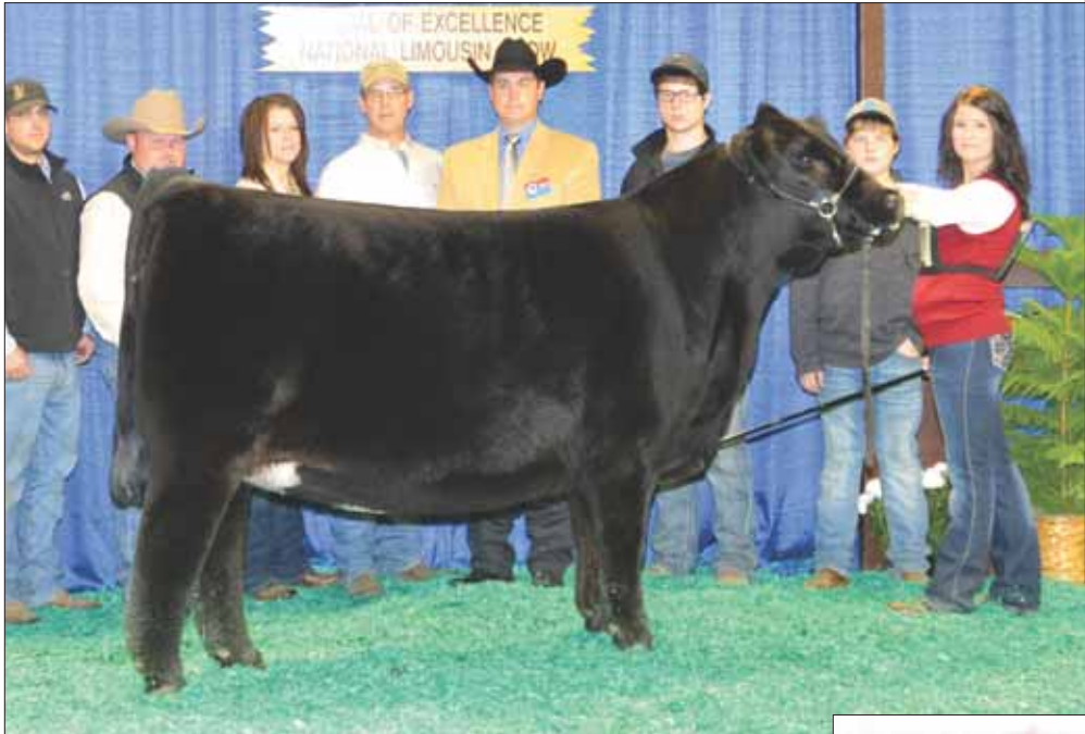
LLJB Absolute Style, donor dam of Lot 9 Pick.