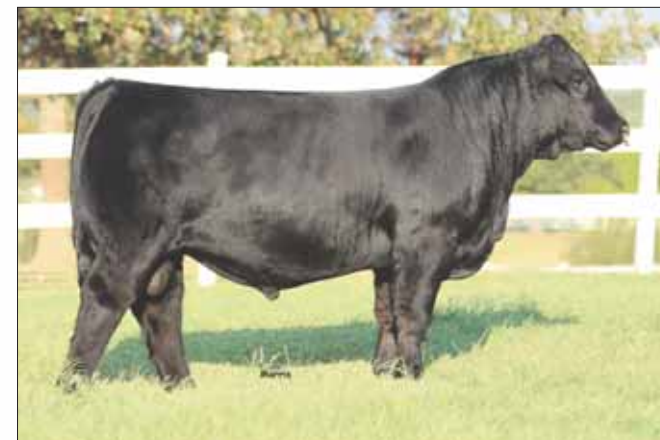
RLBH Days of Thunder ET, Lot 16 sire.