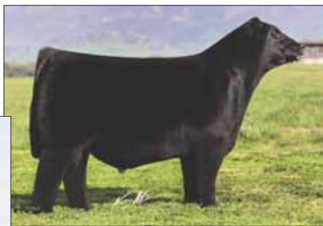
Colburn Primo 5153, sire of Lot 18A.