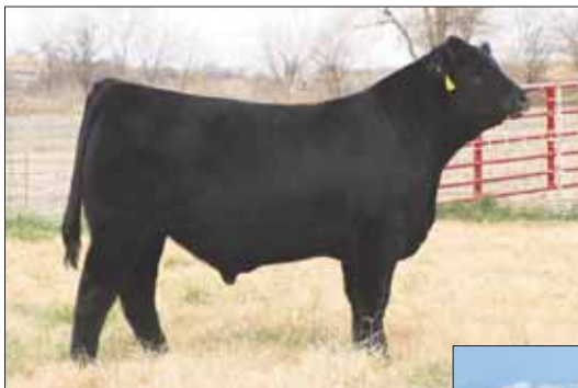
DEBV Gladiator 917G, Lot 42B sire.