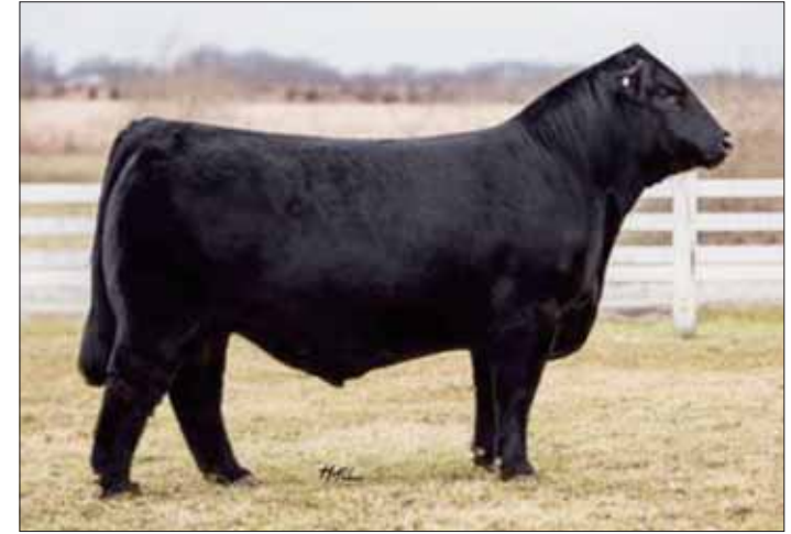
FWLY Can Do, Lot 29A & 29B sire.