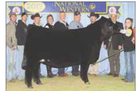
Riverstone Charmed 50C