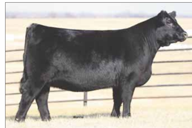
AUTO Chaperall 406C ET, dam of Lot 12.