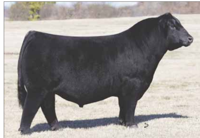
Conley Express 7211, Lot 37 sire.

Now these will be embryos that you won't soon forget! Cross Creek Farm, Circle R Ranch and Win Vue Enterprises have consigned three conventional embryos to the mating of Conley Express 7211 and AUTO Solo 419E. Conley Express 7211 is a son of Sma Watchout 482, a son of Silveiras Watchout 0514. His dam is DPL Sandy 3040, a Silveiras Style 9303 female. Conley Express' first fourteen offspring to sell averaged $29,500 at Express Ranches Big Event Sale. He was a true crowd favorite at the 2018 National Western Stock Show. AUTO Solo is a daughter of the great Riverstone Crown Royal bull and out of AUTO April 202A, the MAGS Manuela daughter out of SAV Brave 8320. We are excited to see what these three conventional embryos can do in your program and beyond! They will be 37.5% Lim-Flex and double homozygous.