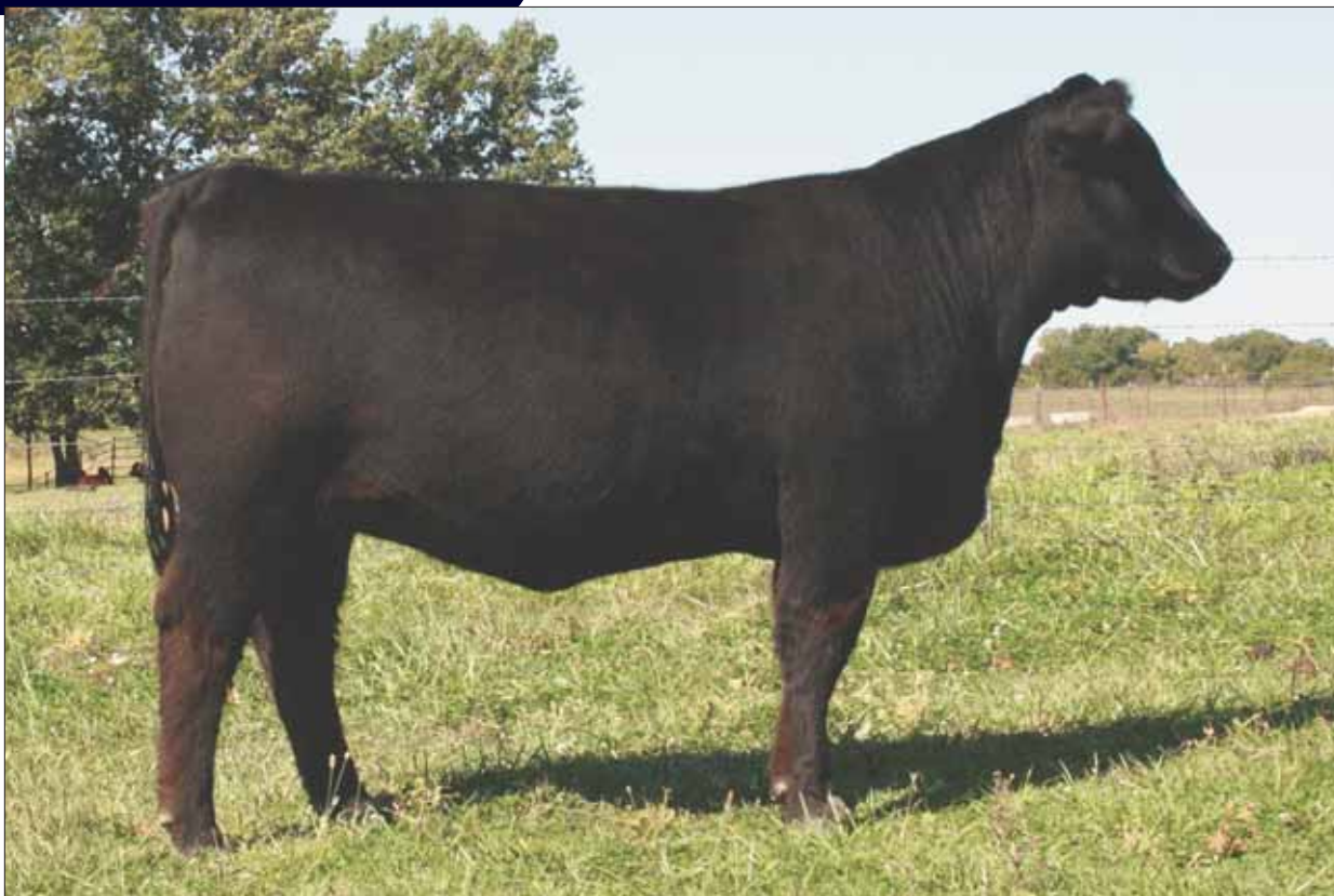
Lot 16 ~ JBFI Grace 503G