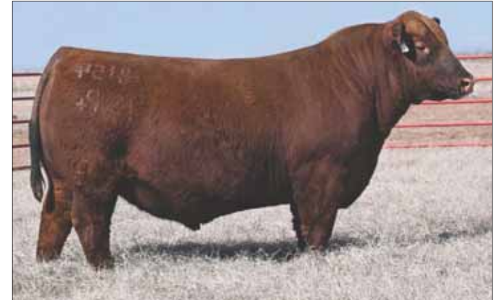
DUFF Red Bear 18154, Lot 31 sire.

LVLS LONELY VALLEY SEEDSTOCK LVLS CRESTON, NE