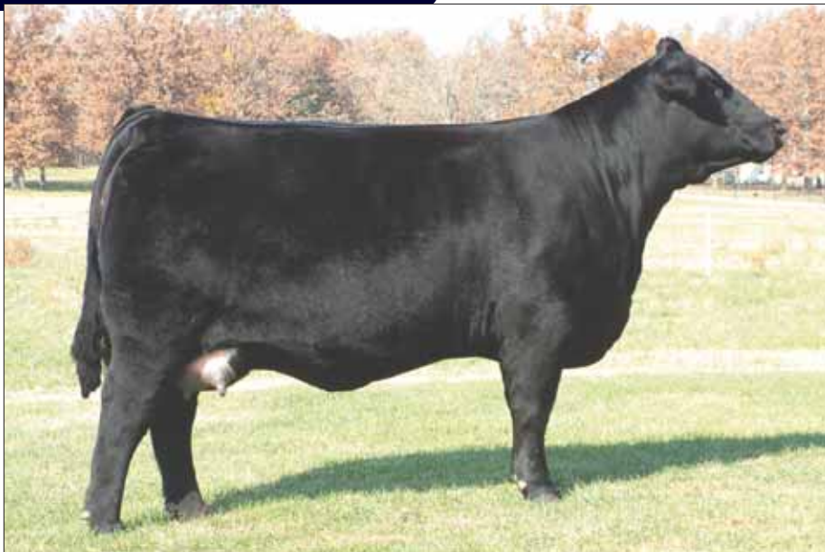
AUTO Rebeca 292S, dam