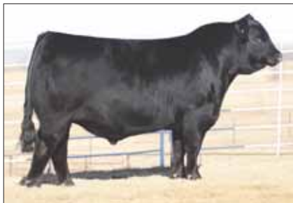
MAGS Cable, sire of Lot 9 Pick.

All ET calves will be born January/ February 2021.