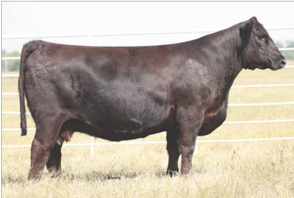
Lot 15 ~ MAGS Checkered Veil