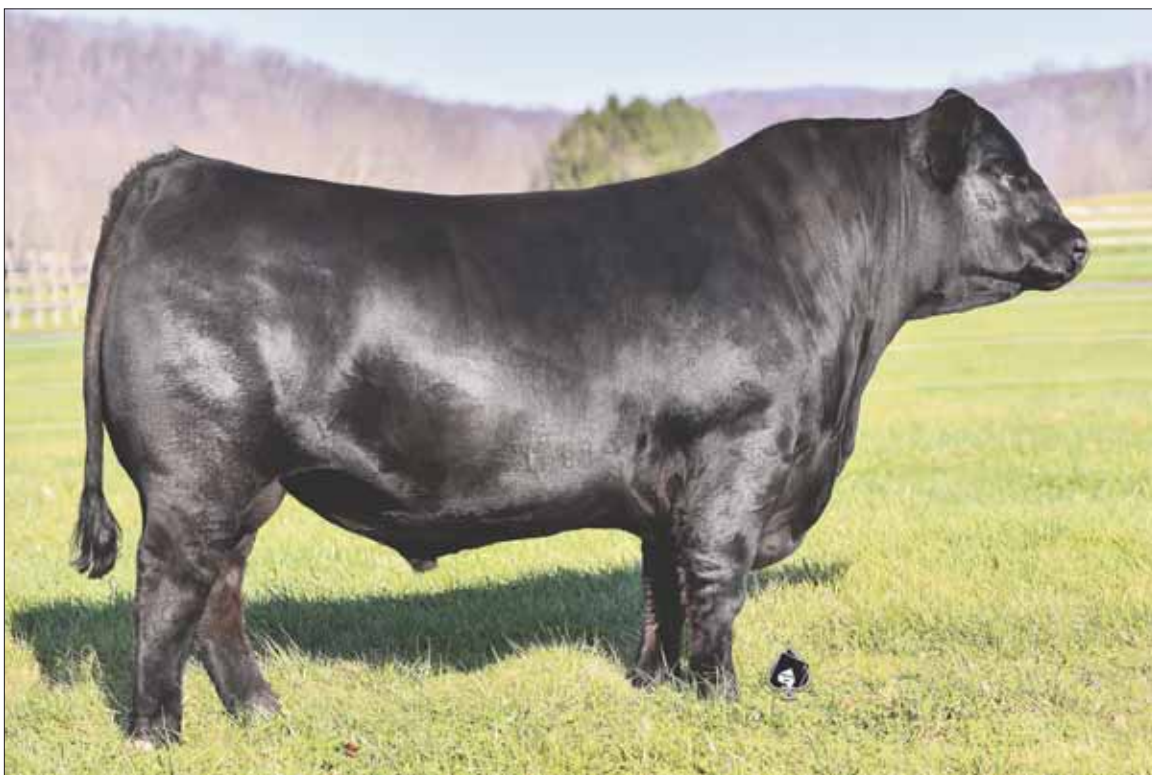
COLE Genesis, full sib to Lot 40.