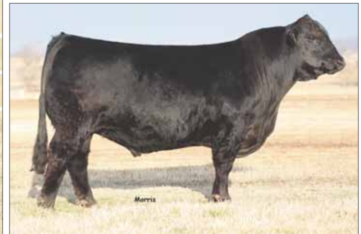
MAGS Zodiac, Lot 15 sire.

A.I. 04.10.2020 to MAGS Federal Reserve; P.E. 4.22-7.27.20 to AHCC Digging Deep 903D. Safe. Due Approximately 2.11.2021.