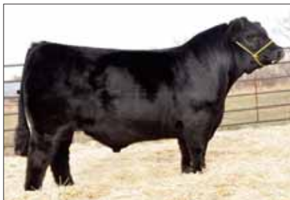
L7 Calvados, sire of Lot 9 Pick.