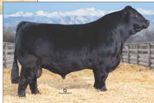
ELCX Kings Landing 599D, Lot 42A sire.