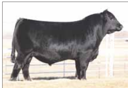
MAGS Firestone, sire of Lot 9 Pick.