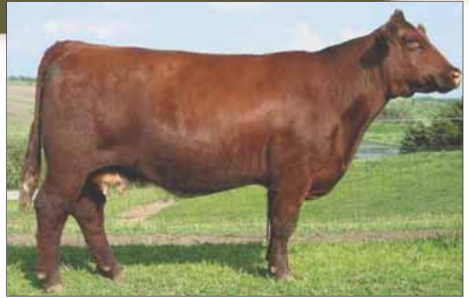
DSF Party Gal 57C, dam of Lot 25.