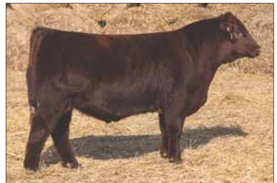
PVF Cowmaker 20H. Service sire to select bred heifers.