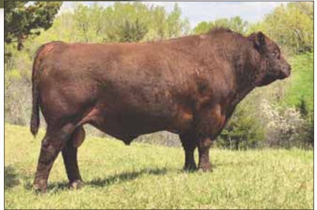
DMH Cherry Fillet, service sire to Lot 73. This bull is one of the best Native Shorthorns we have used.