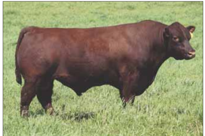
Gilmans Envied 448B, sire of Lot 66.