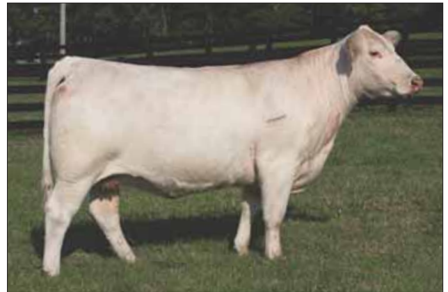
/ CAG GARW MS FAITH 8608F, donor dam of Lot 62 pregnancy.