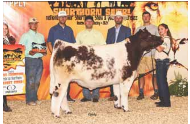
/ FSF ENZO, Full sib to Lot 63 pregnancy.