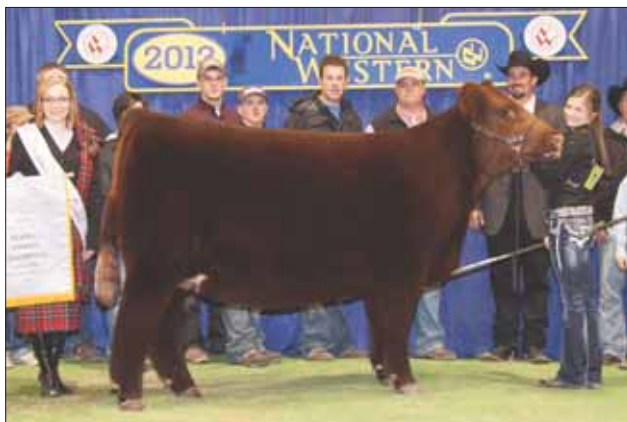
/ SS DREAM LADY 161, Full sib to donor dam of Lot 66 embryos.