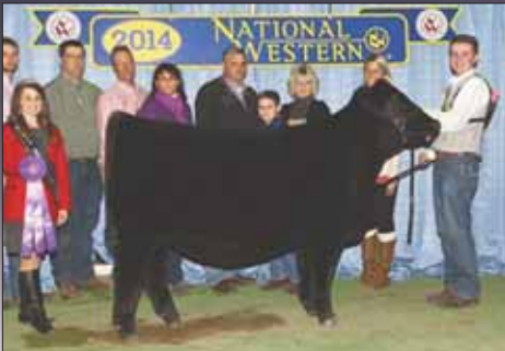
/ GREIMAN JENSEN PROVEN QUEEN9, dam of Lots 1 - 4 and 13.