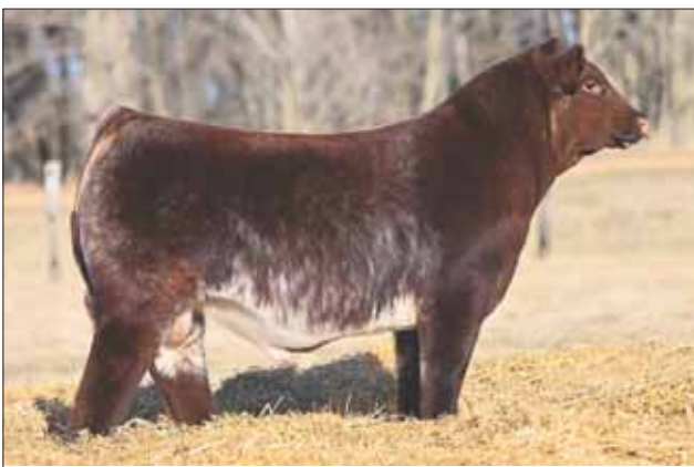
/ SS SL TRAIN STATION