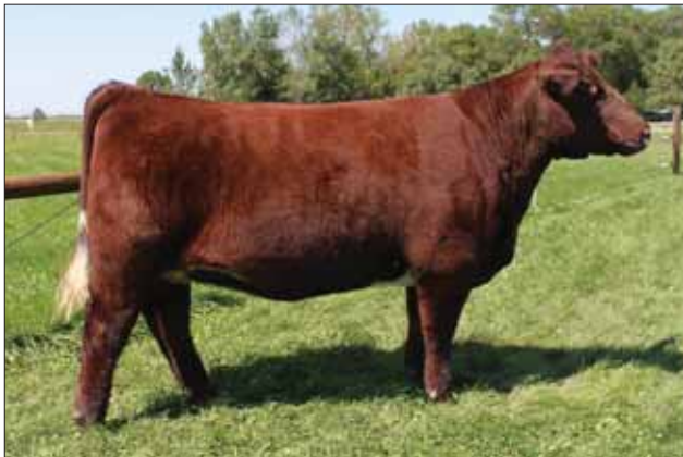
/ SULL MYRTLE BO 9154, Donor dam of Lot 64 pregnancy.