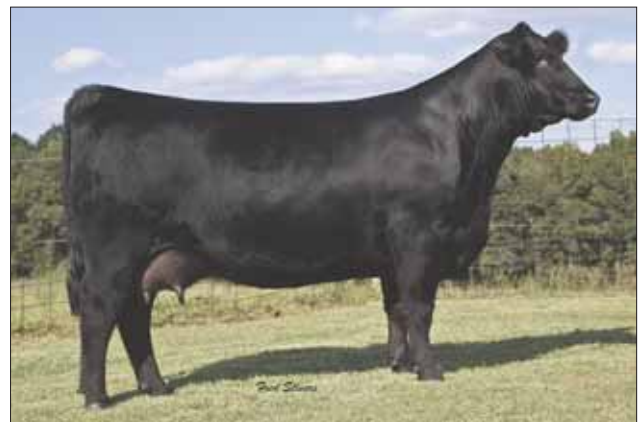
/ CHAMPION HILL GEORGINA 8308, dam of Lot 17.