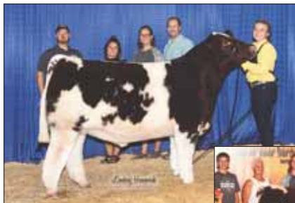
/ BARNEY, Full sib to Lot 65 embryos.