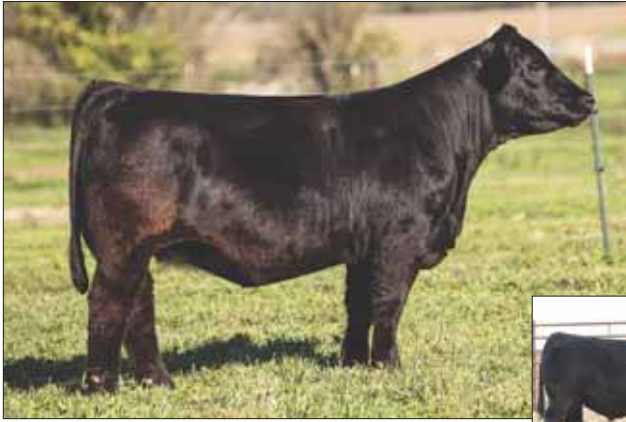
/ OMF EPIC E27, Service sire Lots 33 and 34.