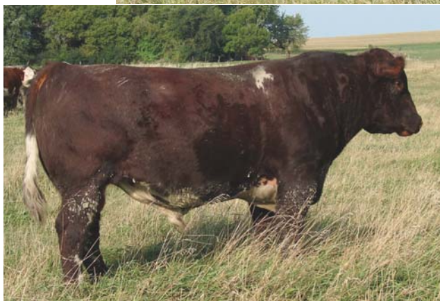
MAV Bellringer 804U