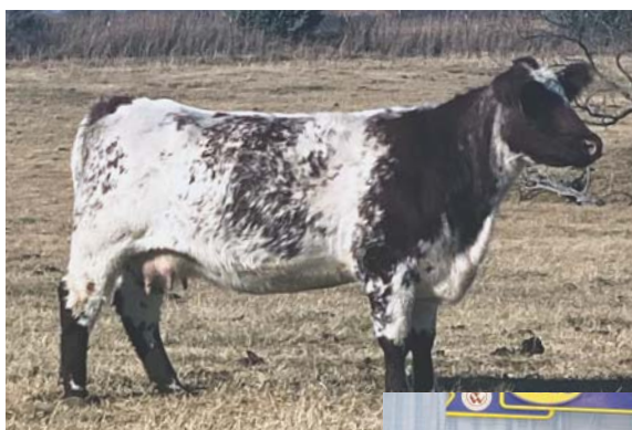
Augusta Pride 7781, donor dam of Lot 54.