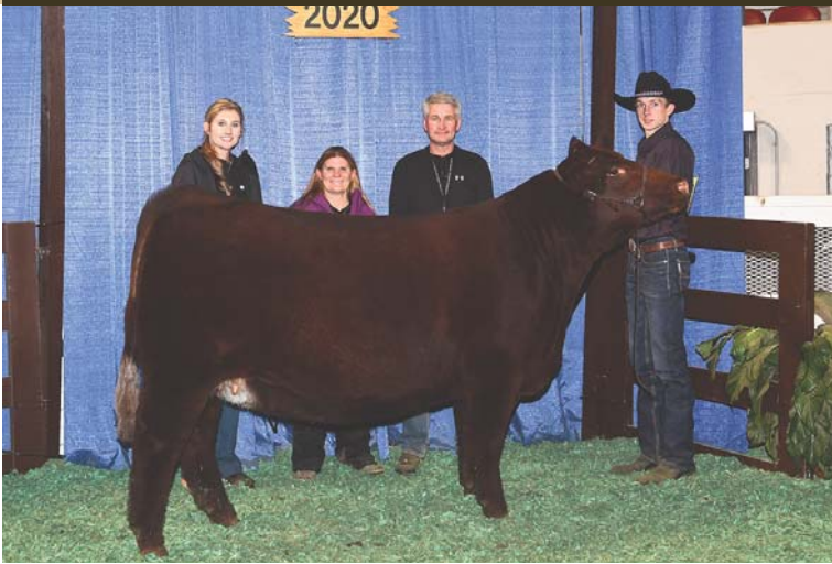
Full is to Lot 55 embryos.