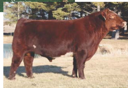
Free K-Kim Hot Commodity, sire of Lot 53 embryos.