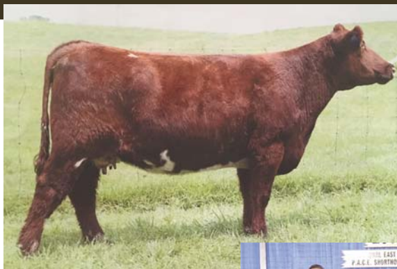
CF Margie 114 RD, donor dam to Lot 52 embryos.