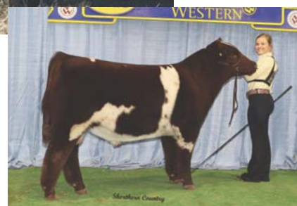
CF Chosen 815, sire of Lot 54 embryos.