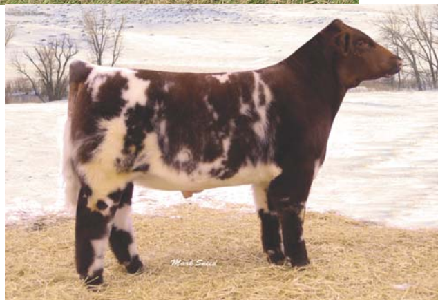
Hi View's Ace of Diamonds