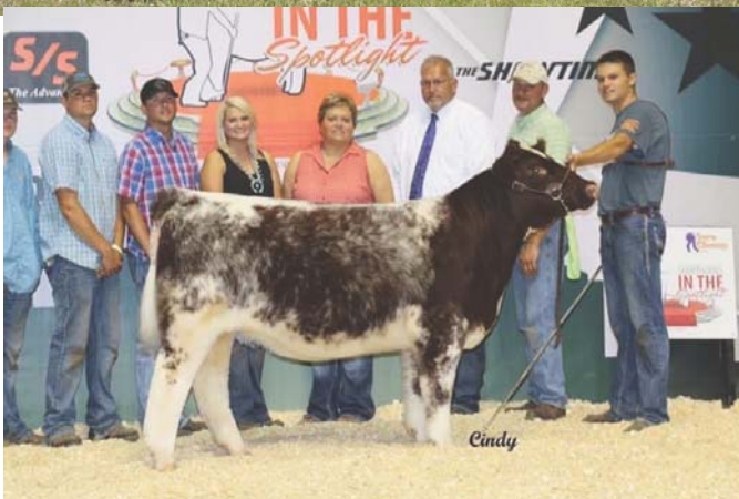
MAV Toni 560C ET, dam of Lot 56 and full sib to Lots 10 & 11.