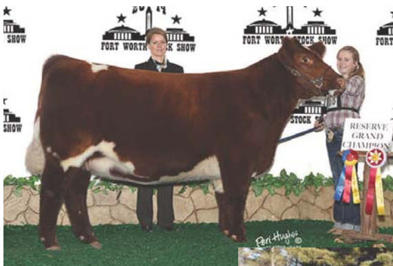
HCAT Cumberland 12102 ET, maternal sister to the donor dam of Lot 53.