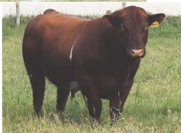
CYT Maxim 9202 ET