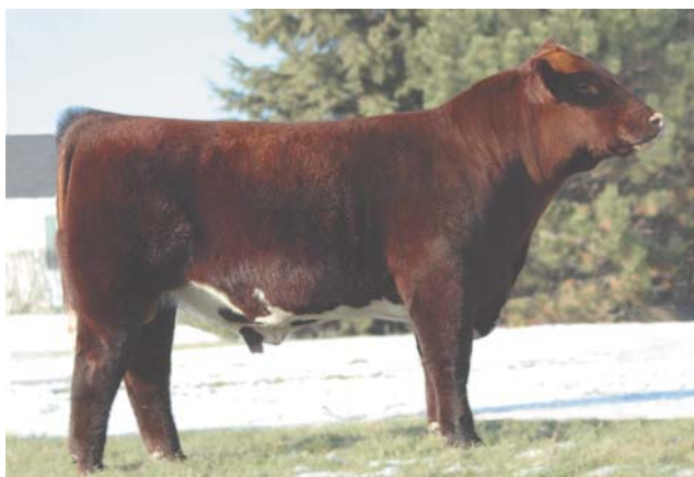
Little Cedar Aviator 503X