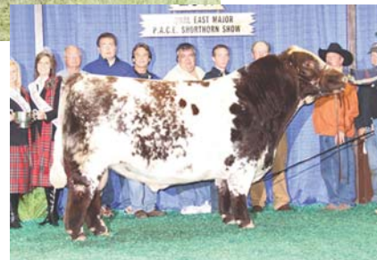
SULL Traveler 9807 ET, sire to Lot 52 embryos.